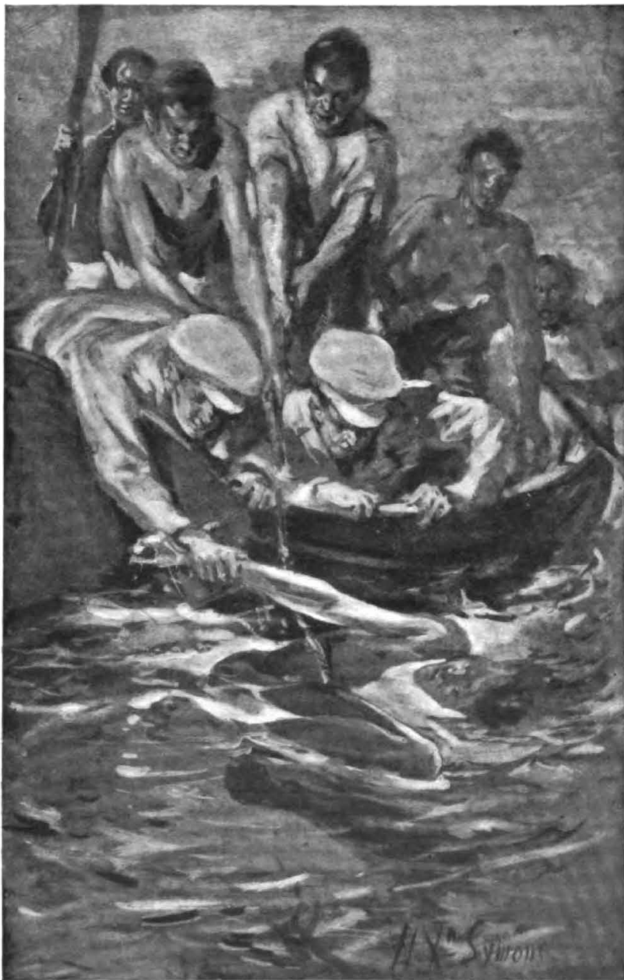
"WE HAULED HIM ABOARD."

of the boat, got the water out of him by the Royal Humane Society method, poured a dram down his throat, and after a bit he came round ; but he couldn't speak.