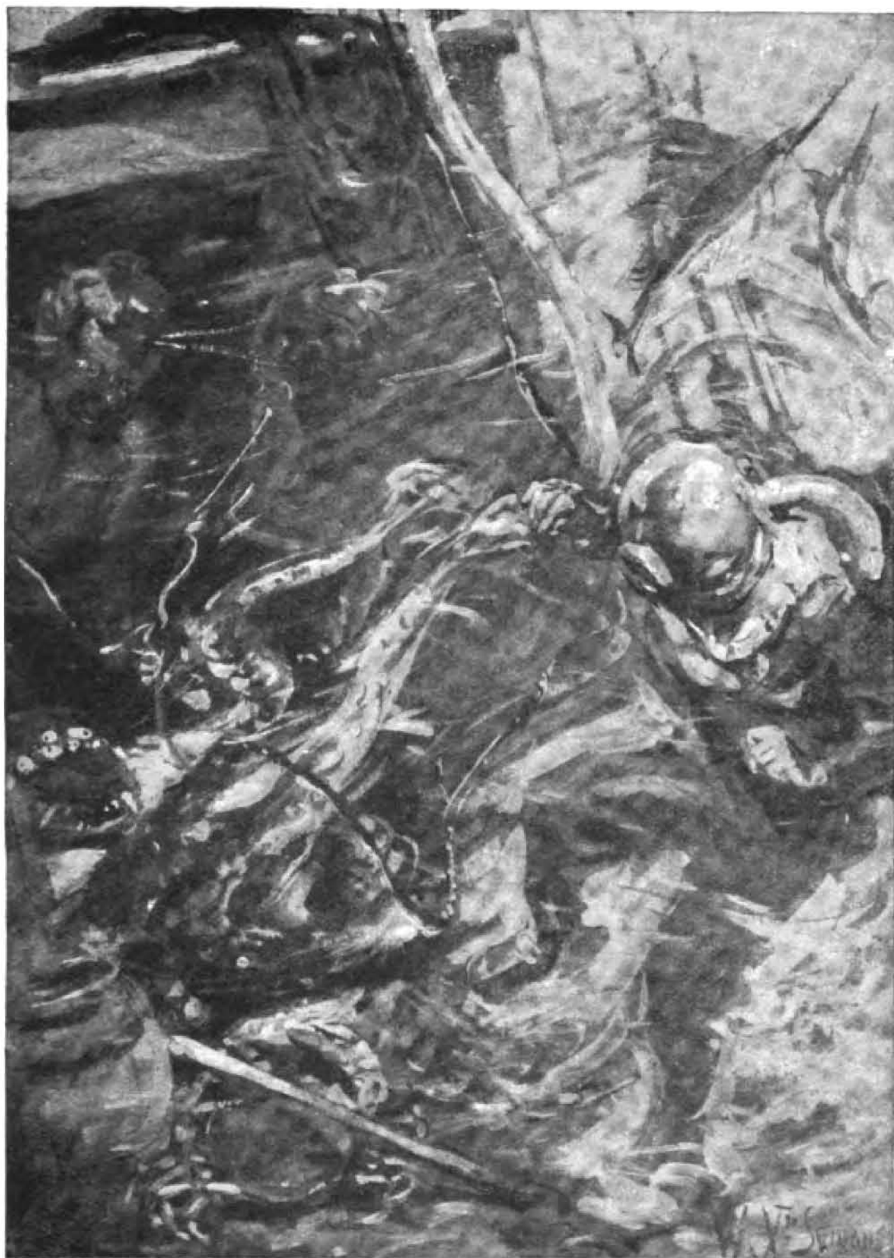
"ONE HIDEOUS CLAW LAID HOLD OF MY BARE HAND."

they saw right away the head of the Aitu shove out of the door, and there he stuck. So we warped the schooner close, rove the rope through a block at a yard-arm, and laid on.