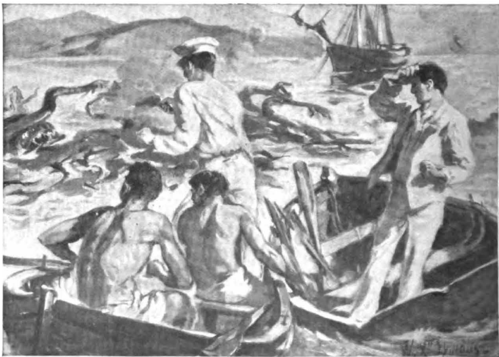
"THE MONSTER SPUN ROUND AND ROUND, BEAT THE WATER, AND THEN WENT DOWN."

We made the Society Island in seventeen days and ran into the roadstead flagged. You should have seen how they put in the time for us when they heard what we had aboard. They say it was the biggest corroboree ever known in the islands. Any-