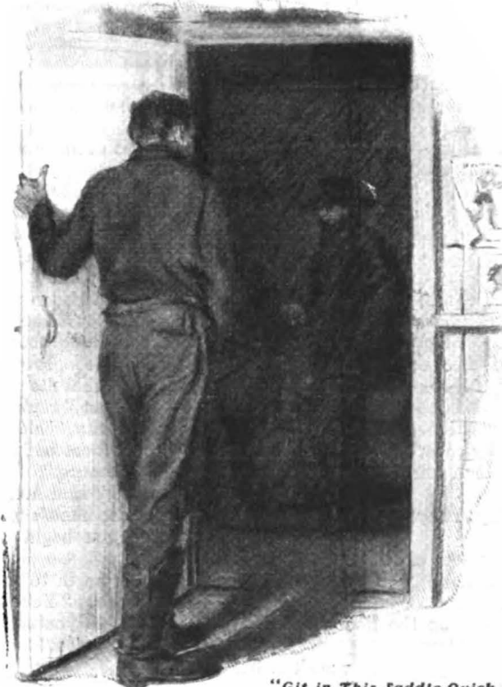
"Git in This Saddle Quick. A Scantlin' Fell at the Jones No. 1"