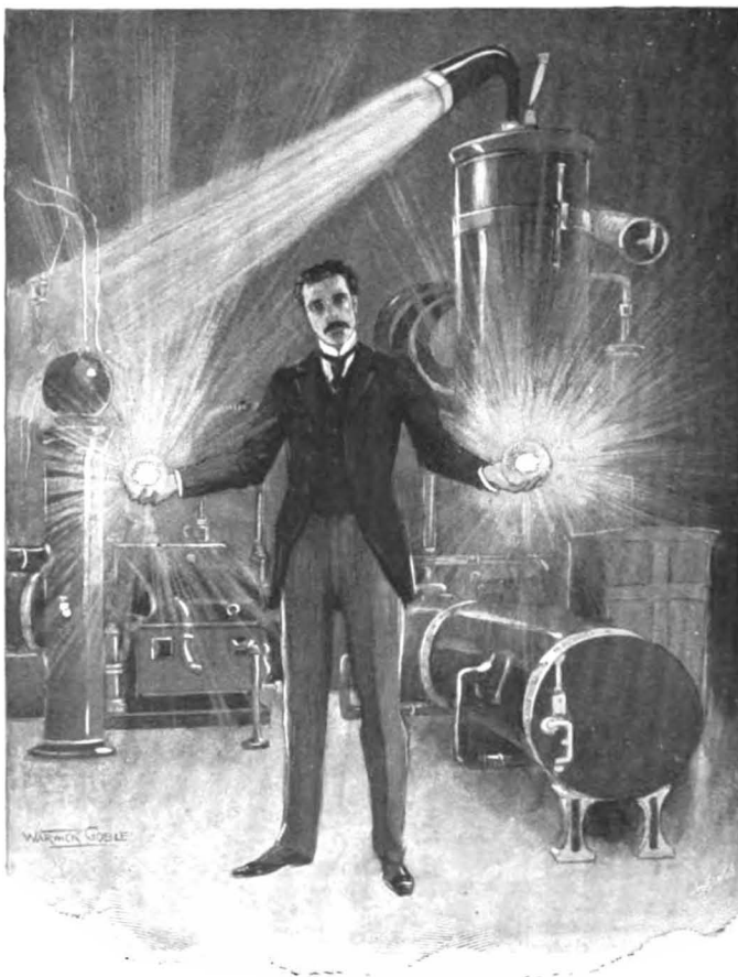
Nikola Tesla holding in his hands balls of flame.

"Oh, pshaw! these are only a few play-things," Nikola Tesla replies when the visitor puts into words the astonishment he has experienced; "none of these amount to anything—they are of no value to the great world of science. But come over here and I will show you something that will make a big