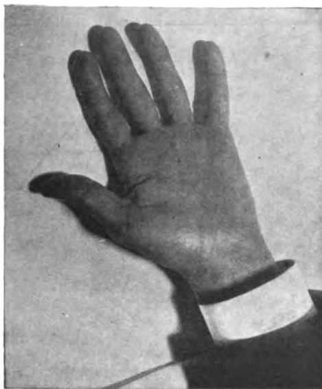
The hand of Nikola Tesla, taken by his wonderful artificial daylight, just perfected. This is the first photograph made by the light of the future.

How these conservative scientists sneered at Tesla's "Utopian audacity" when he first suggested that man should harness the great Niagara Falls! But they humbled their pride sufficiently