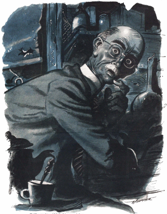
His killer moved to watch in the living room windows.