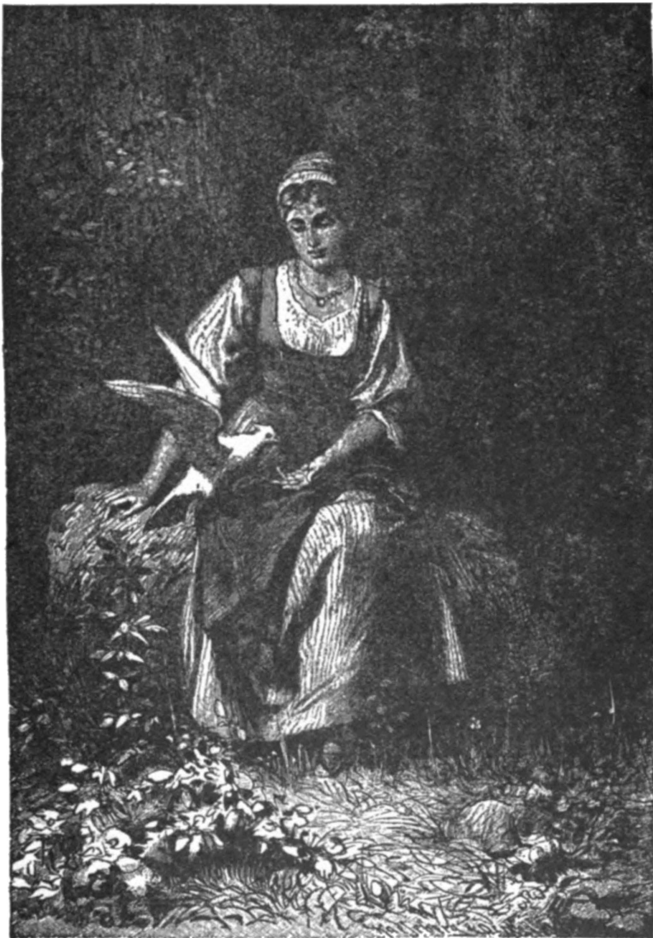
THE WHITE DOVE WITH THE GOLDEN KEY