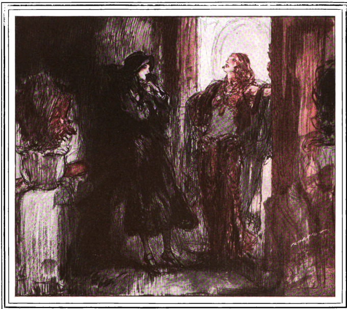
SHE DID NOT SEEM TO SEE ME, TO SEE ANYTHING. HER FACE WAS STRAINED AND ASHEN UNDER THE PAINT

D O YOU believe in miracles, Sister?" The young countess sat propped up in the great bed. It was an old bed remaining from a pretentious age—on a dais, with heavy curtains drawn back, and the high headpiece surmounted by a gilt coronet. She looked like a very young girl, not twenty, with the fresh luster of youth. Her heavy, dark hair was about her face. The face was slender, the eyes large, the mouth, that feature so rarely excellent in a woman, small and exquisite.