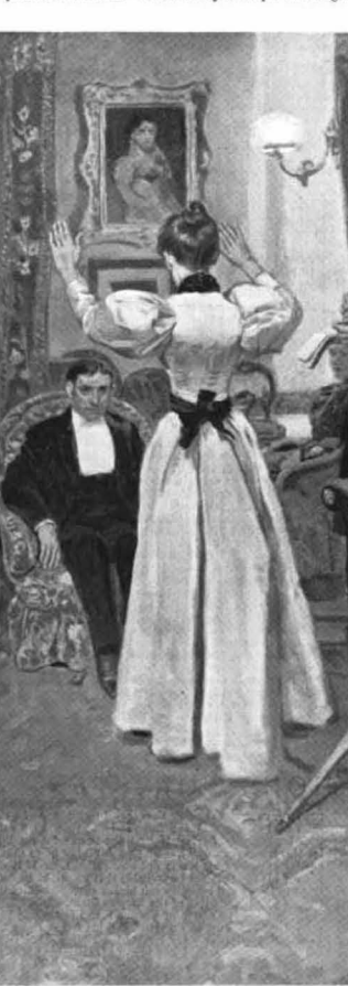
"I WAS CONSCIOUS ONLY OF HER OWN EYES LOOKING DOWN AT ME, GRAY, DEEP, INSCRUTABLE."

TO M.—I believe that I am on the threshold of an epoch-making investigation. To have the power of examining these phenomena from inside—to have an organism which will respond, and at the same time a brain which will appreciate and criticize—that is surely a unique advantage.