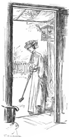
"AN IMPORTED GIRL WITH FIXINGS ON"

"I was punching then for Old Bill Toomey, on the San Miguel. One day I gets all ensnared up in aspirations for to eat some canned grub that hasn't ever mooded or baaed or grunted or been in peck measures. So, I gets on my bronc and pushes the wind for Uncle Emsley Telfair's