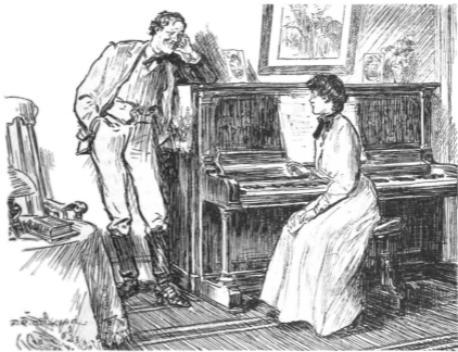
.. 'PANCAKE AVENUE,' SAYS I, WITH A WINK..

.. 'Excuse me for a moment, please,' says Miss Willella, and she gives me a quick kind of sideways look, and slides off the stool. She ambled out into the other room, and