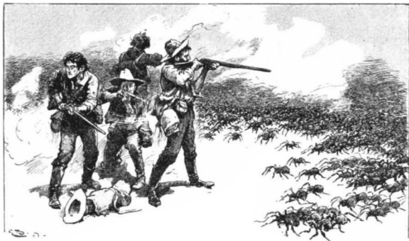
"WE FIRED VOLLEY AFTER VOLLEY."

He sprang to right and left, then towards