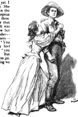
"DON'T GO, OH! DON'T GO."

"Over a fortnight went by. We were growing more and more accustomed to meeting difficulties and to overcoming them, for many obstacles at first sight insurmountable