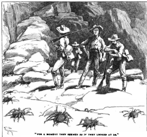
"FOR A MOMENT THEY SEEMED AS IF THEY LOOKED AT US."

"We had long ago, in previous expeditions, grown accustomed to surprises. Few things astonished us now. Never in our lives, however, had we seen such an assemblage of