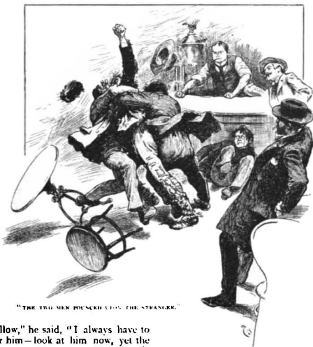
"THE TWO MEN POUNCED UPON THE STRANGER."

"Poor fellow," he said, "I always have to be ready for him—look at him now, yet the doctors pronounce him sane. He often is sane, of course, but when I heard him starting on the spiders, and on brandy as well, I knew what to expect."