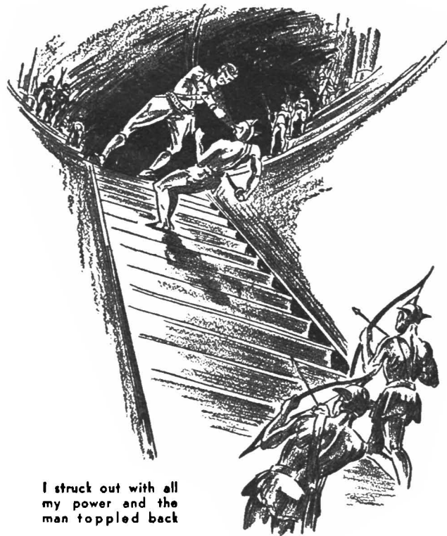
I struck out with all my power and the man toppled back

He scowled. "It sounds much the same. And did you really come from the Green Star?"