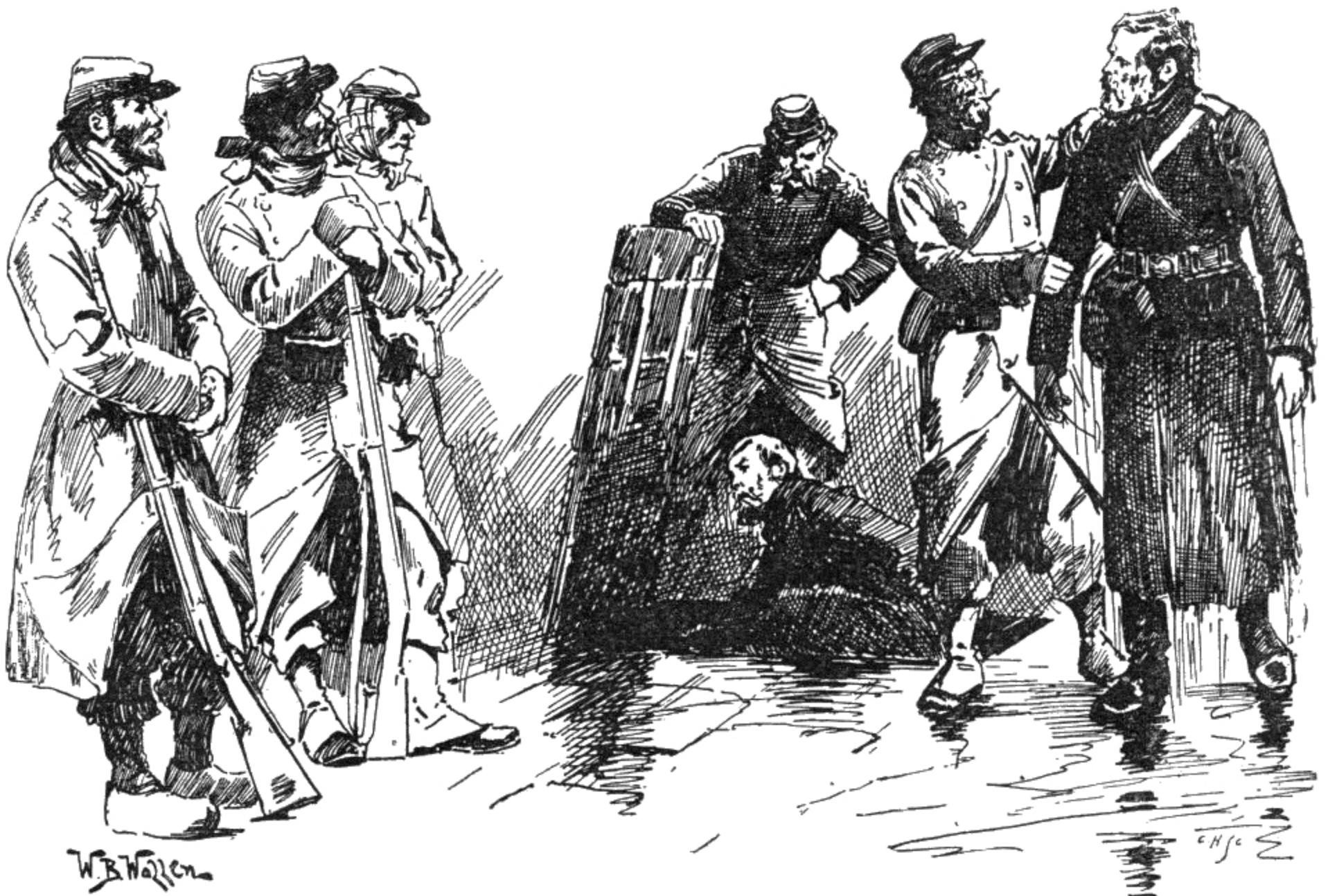
"THE SIX GERMANS WERE SEEN ISSUING FORTH."

M. Lavigne received a decoration for having taken prisoner a Prussian advance-guard; and the fat baker had the military medal for wounds received in face of the enemy.