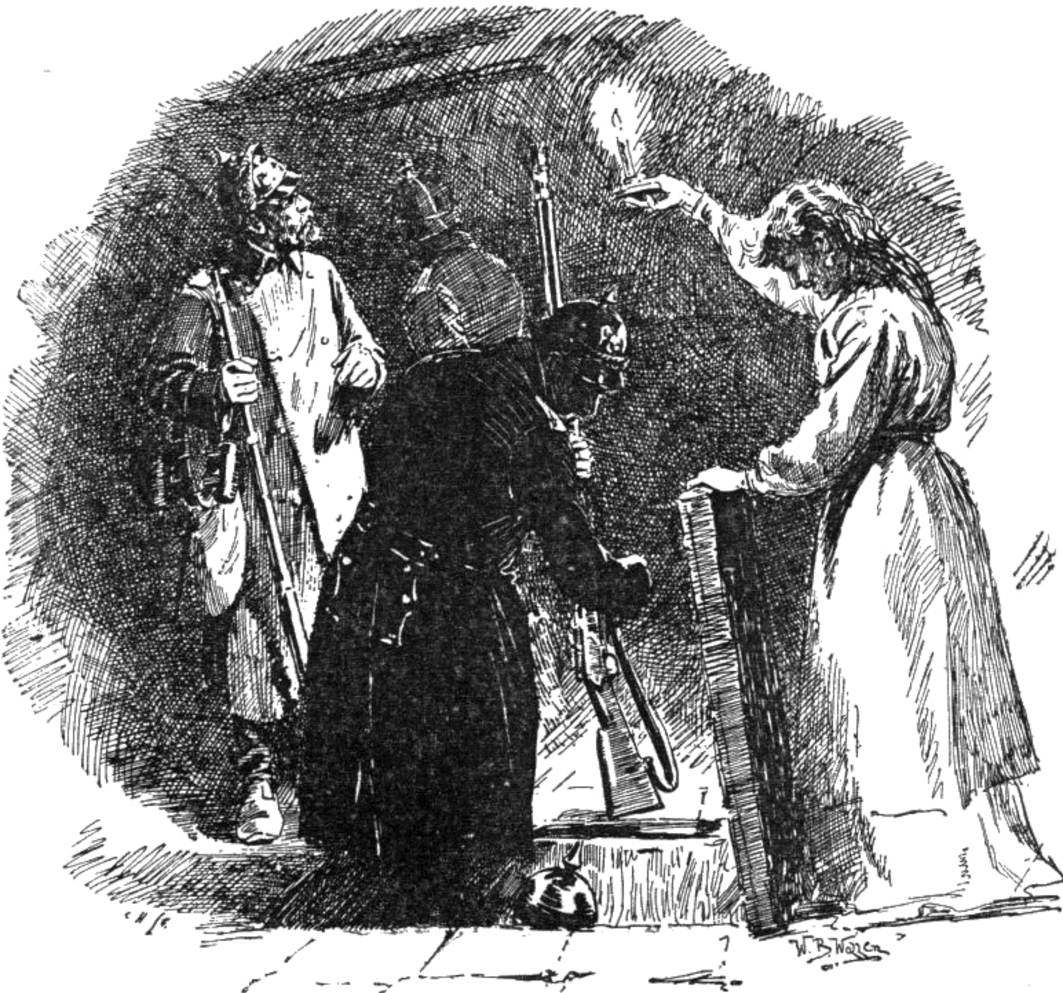
"THE MEN DISAPPEARED BY THE WINDING STAIR."

The keeper's wife heard him go down again. Then, one after another, the soldiers came up to try their strength and inspect the fastenings.