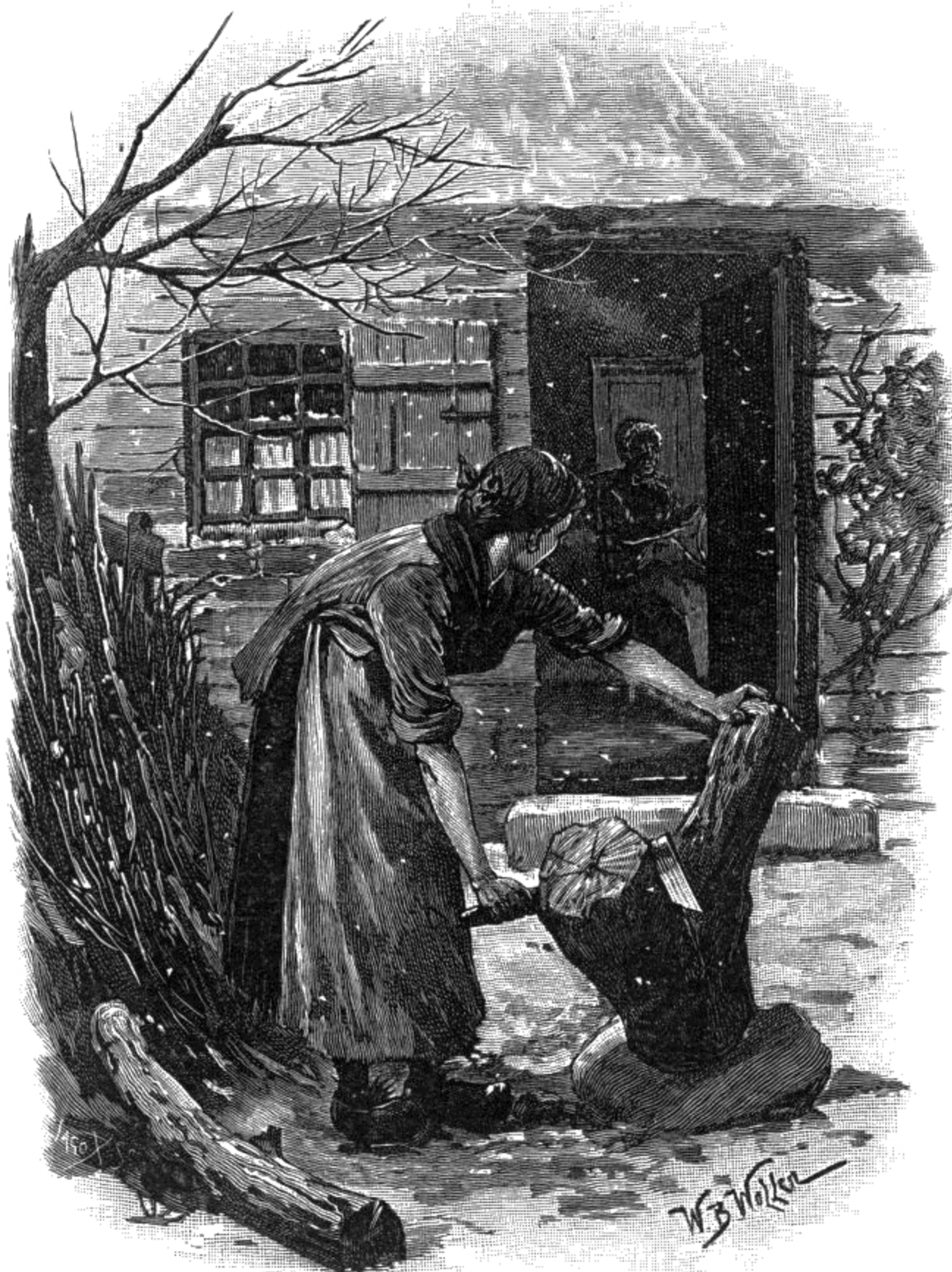
"COME IN, BERTHINE."

The nearest town was Rethel, an old fortress perched on a rock. It was a patriotic place, and the townspeople had resolved to resist the invaders, to close their gates and stand a siege, according to the traditions of the city. Twice before, under Henry IV. and under Louis XIV., the inhabitants of Rethel had won fame by heroic defences. They would do the