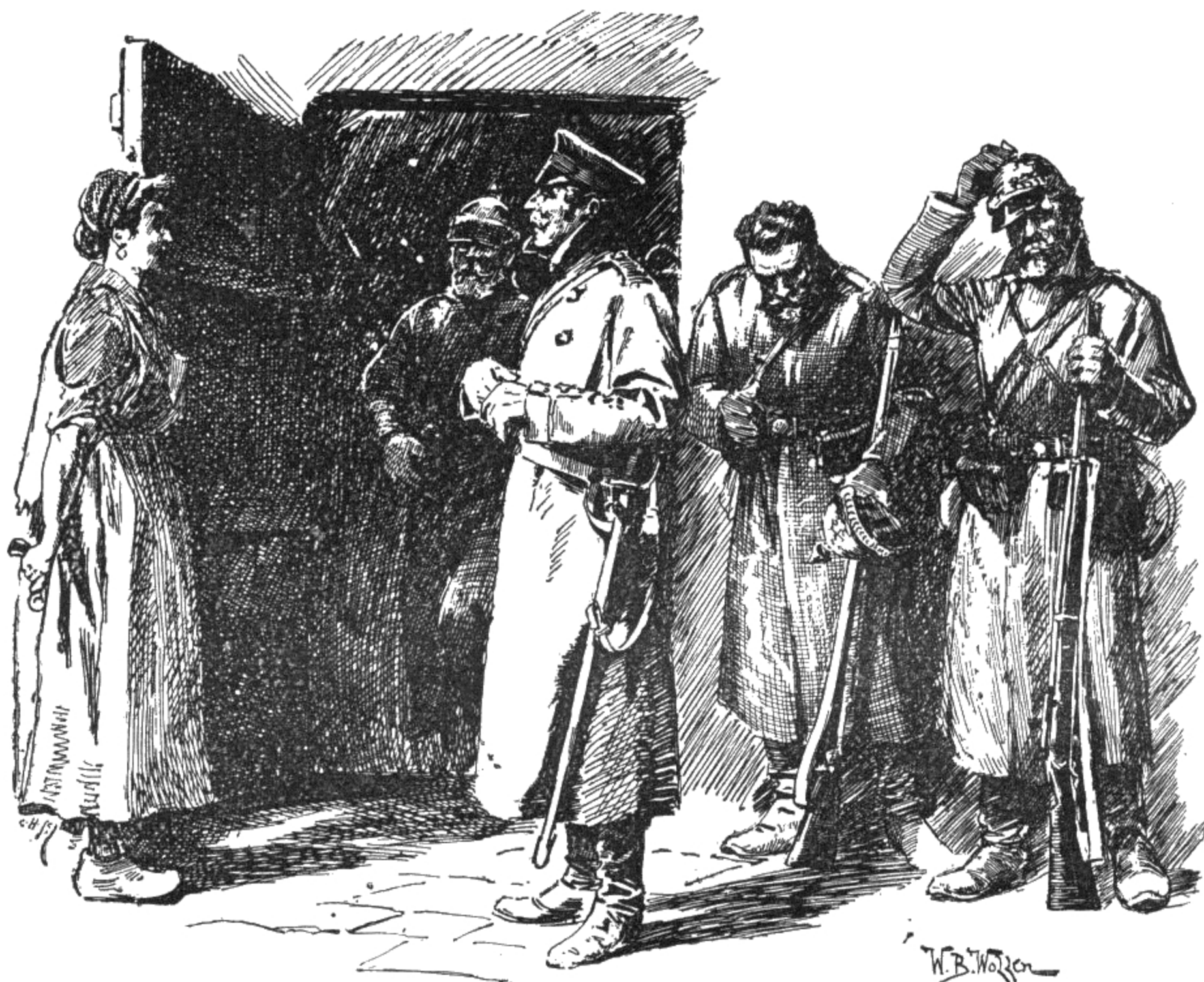
"THEY CAME IN, POWDERED WITH SNOW."

that also to the stew. The eyes of the six men followed her every movement with an air of awakened hunger. They had set their guns and helmets in a corner, and sat waiting on their benches, like well-behaved school children. The mother had begun to spin again, but she threw terrified glances at the invading soldiers. There was no sound except the slight purring of the wheel, the crackle of the fire, and the bubbling of the water as it grew hot.