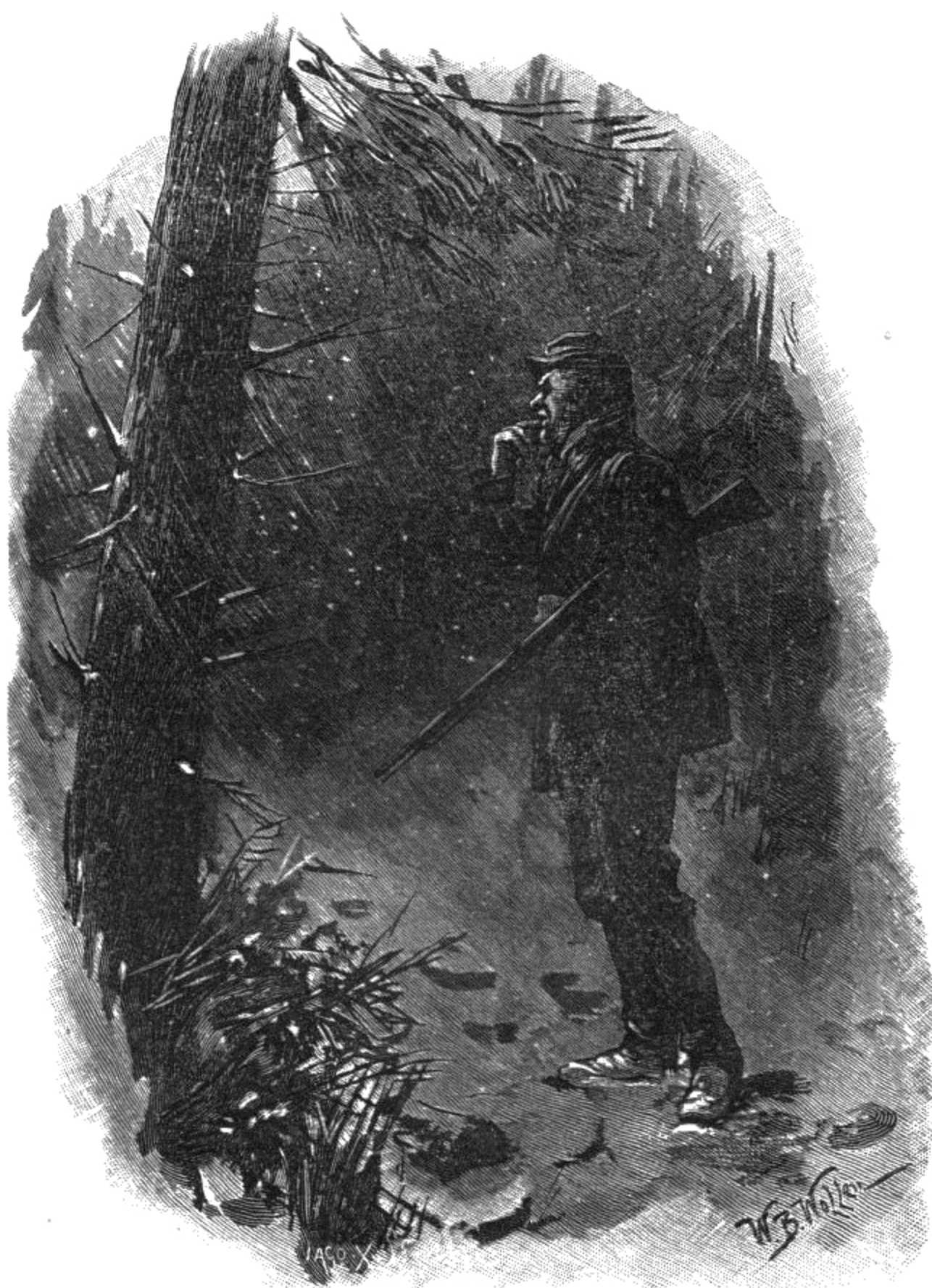
"HE GAVE A LONG, STRIDENT WHISTLE."

She opened the door once more to listen for them. She perceived a shadow moving cautiously. She was frightened, and screamed. It was her father.