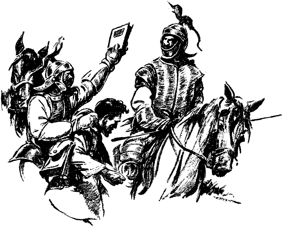
"The swine's a Reader! He's got a book!"

crawled back to look, he saw a great jagged rent where the arch had been. Light shone through twisted window frames. He had blasted in a row of castle windows. It was crazy, but he noted that they were Gothic. High and pointed.