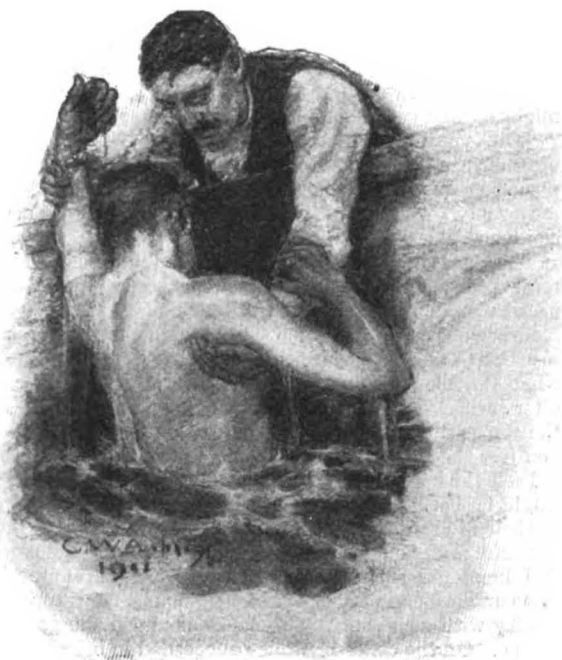
With Pull and Heave and Quick-Changing Grips He Drew on Deck the Naked Form of Aloysius Pankburn

"I can't. He's got all my money. If I fired her he wouldn't give me sixpence to buy a drink with."