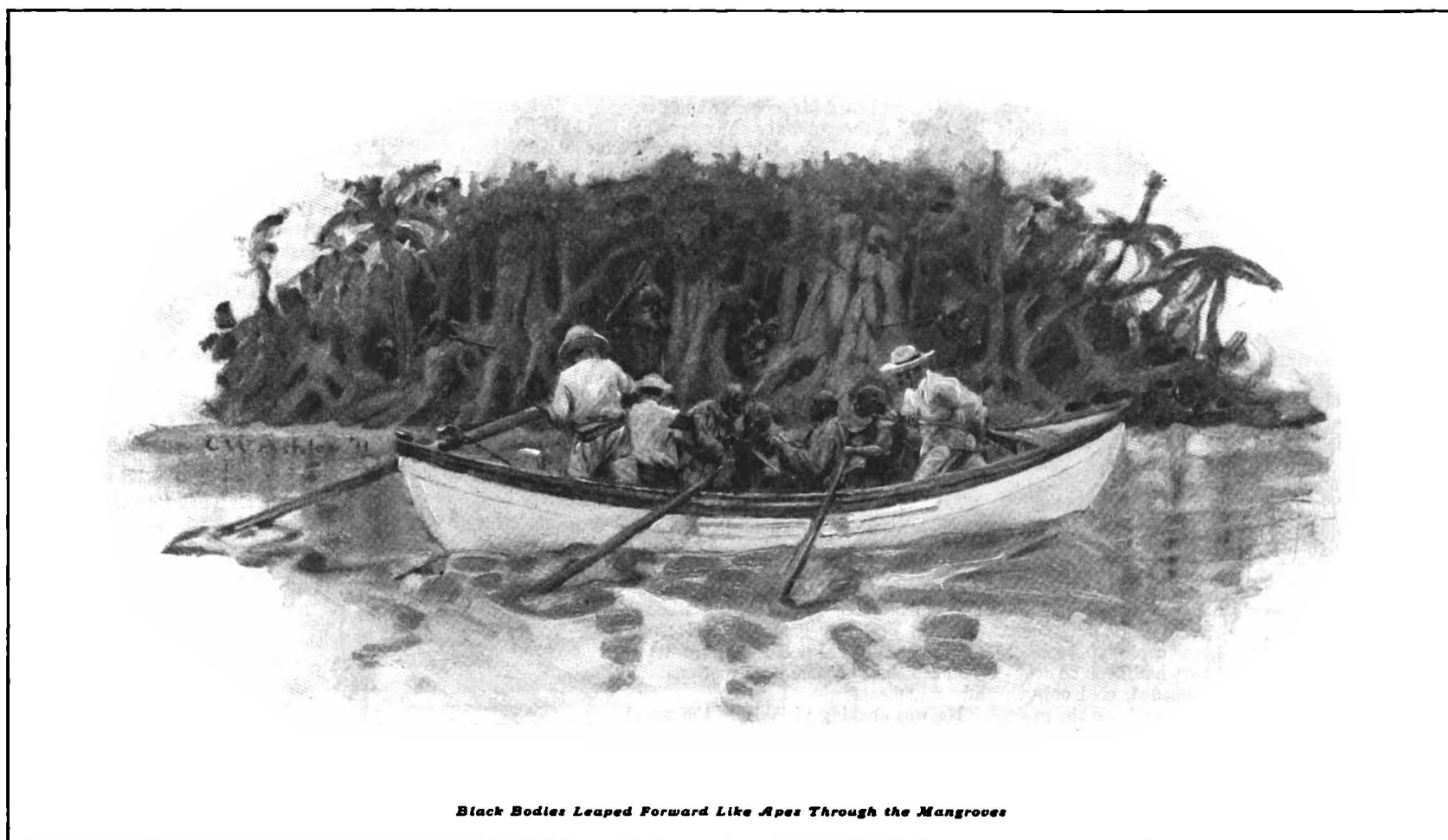
Black Bodies Leaped Forward Like Apes Through the Mangroves

Q UICK eye that he had for the promise of adventure, prepared always for the unexpected to leap out at him from behind the nearest coconut tree, nevertheless David Grief received no warning when he laid eyes on Aloysius Pankburn. It was on the little steamer Berthe. Leaving his schooner to follow, Grief had taken passage for the short run across from Raiatea to Papeete. When he first saw Aloysius Pankburn, that somewhat fuddled gentleman was drinking a lonely cocktail at the tiny bar between decks next to the barber shop. And when Grief left the barber's hands half an hour later, Aloysius Pankburn was still hanging over the bar, still drinking by himself.