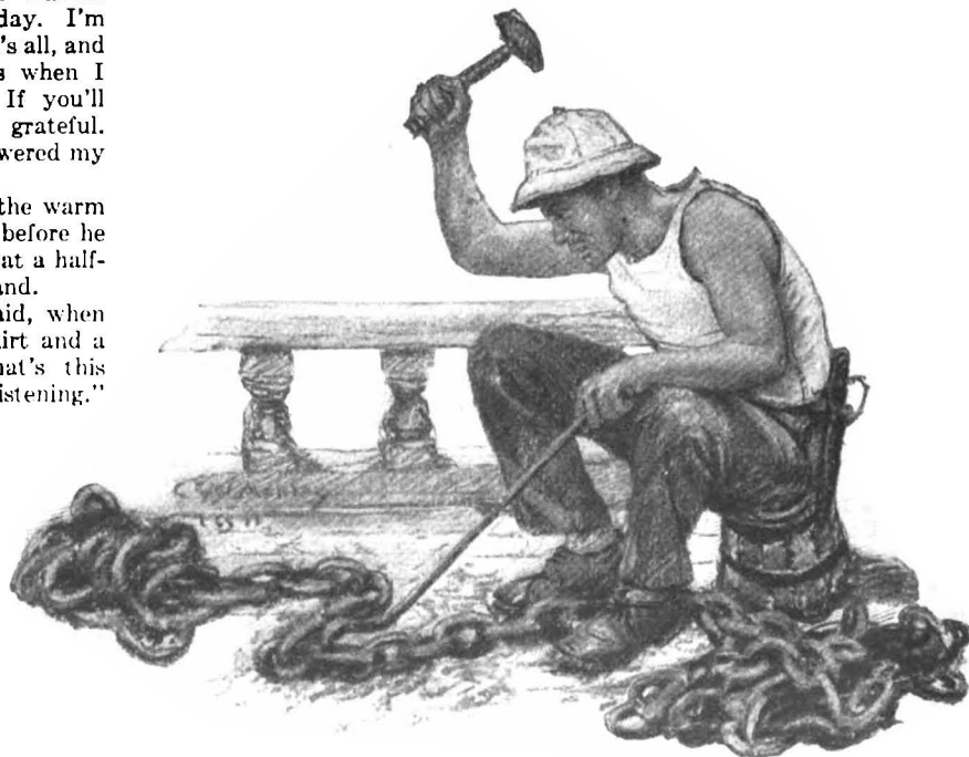
Ten Hours a Day Aloysius Pankburn Pounded Chain Rust

"The mate had been killed a week earlier by the natives on one of the Banks, when they sent a boat in for water. There were no navigators left. The men were put to the torture. It was beyond international law. They wanted to confess, but couldn't. They told of the three spikes in the trees on the beach, but where the island was they did