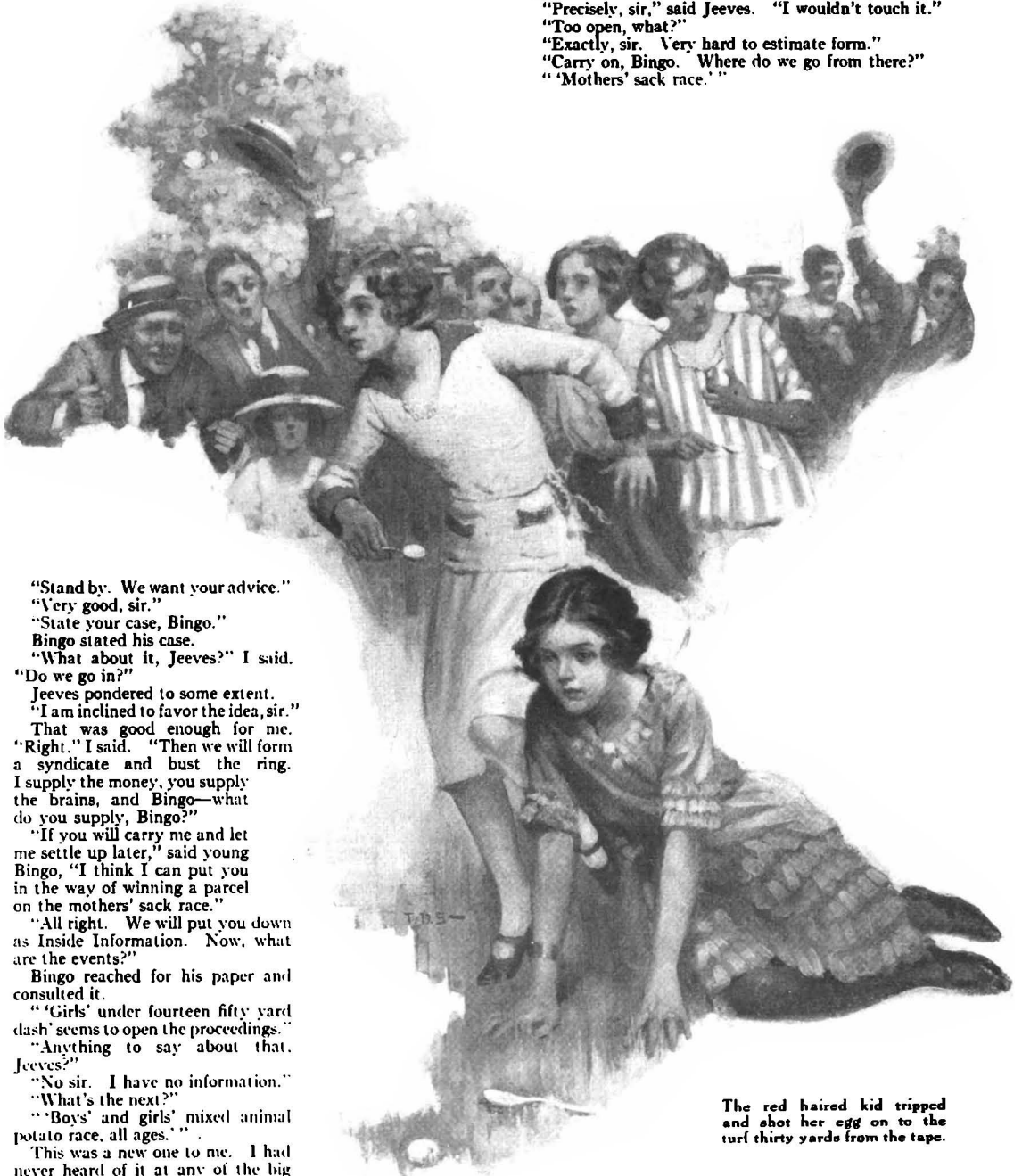
The red haired kid tripped and shot her egg on to the turf thirty yards from the tape.