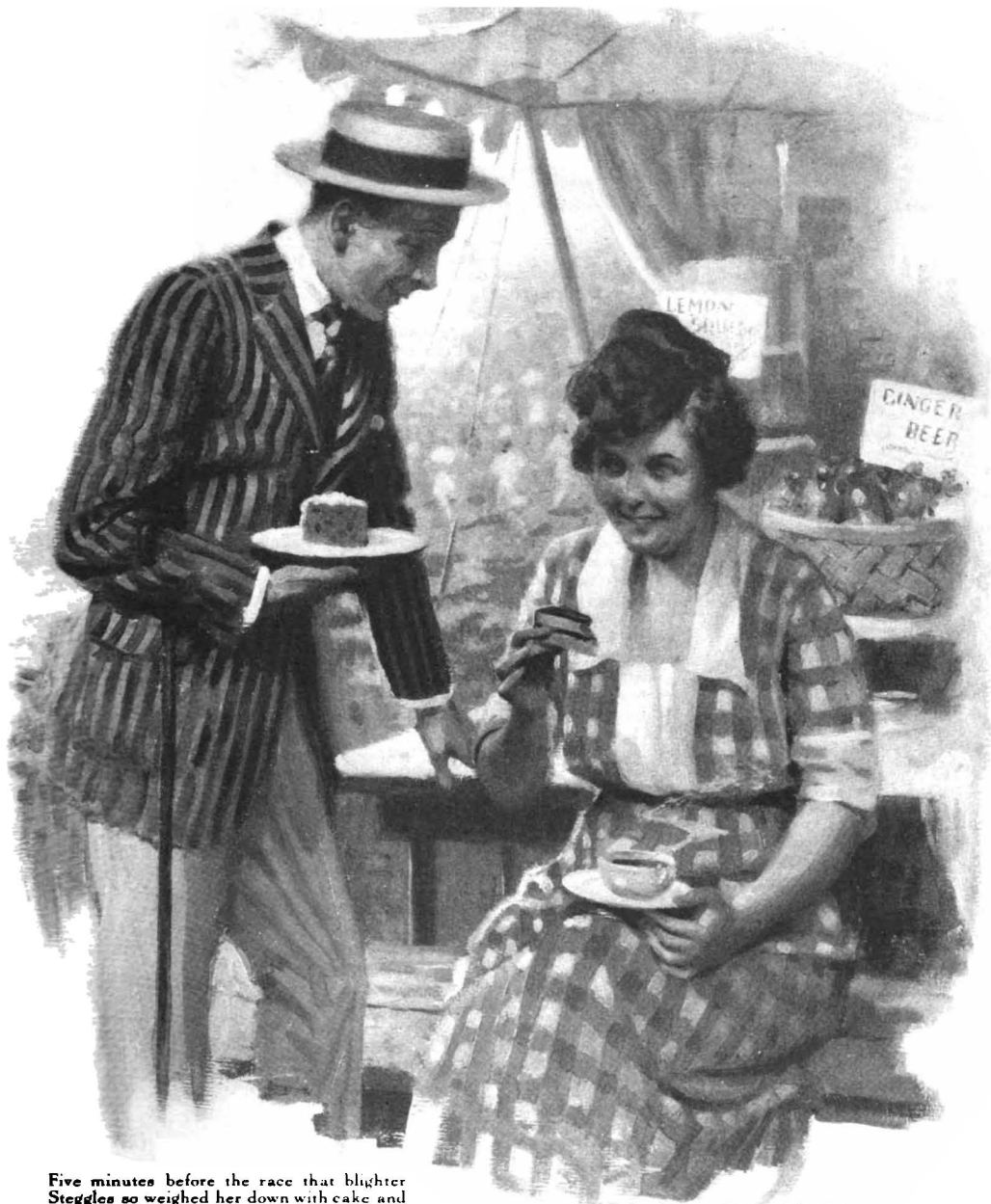
Five minutes before the race that blighter Stegless so weighed her down with cake and tea that she blew up in the first fifty yards.