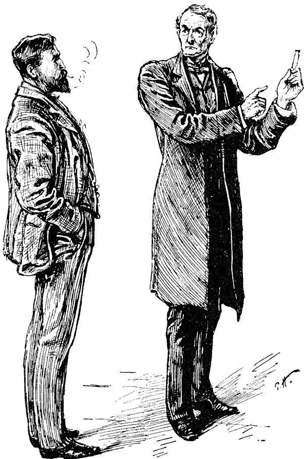
"LOOK AT THAT TUBE NUMBERED 17"

His face lightened up with a glow of enthusiasm. "They contain the microbes of