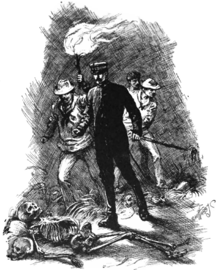
"A RARE HOLOCAUST."

SCARLETT lay in the light of the fire looking about him. He felt restless and uneasy, though he would have found it difficult to explain the reason. For one thing, the air trembled to strange noises. There seemed to be something moving, writhing in the forest trees above his head. More than once it seemed to his distorted fancy that he could