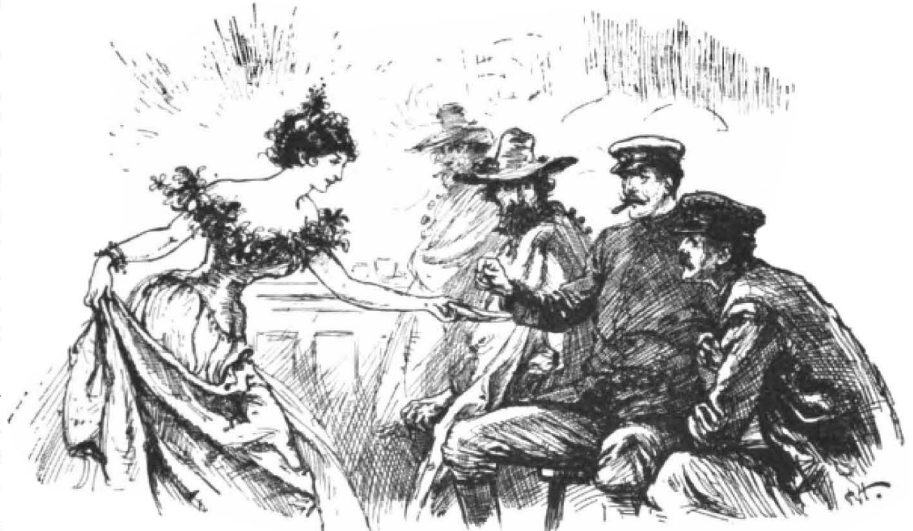
"THE GIRL CAME FORWARD, EXTENDING A SHELL PRETTILY."

"And yet they are magnificent flowers," said Scarlett. "Won't you tell me where you got them from, pretty one?"