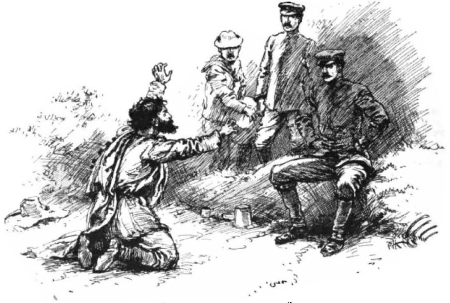
"HE HOWLED FOR MERCY."

"That is easy," Tito replied. "In the daytime I moisten the ground under the trees. Then the suckers unfold, drawn by the water. Once the suckers unfold one cuts several of them off with long knives.