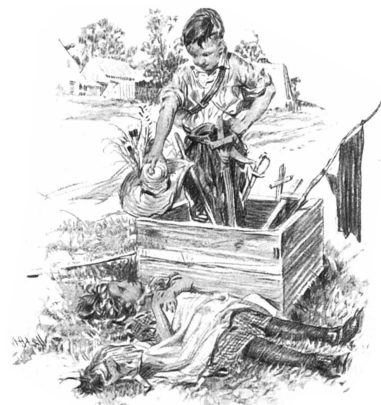
"And So, on the Edge of the Warm Gulf Stream, at Sunset They Buried the Fair Isabel"

"Whether influenced by the passing of the Fair Isabel, or whether his thoughts were turned into more