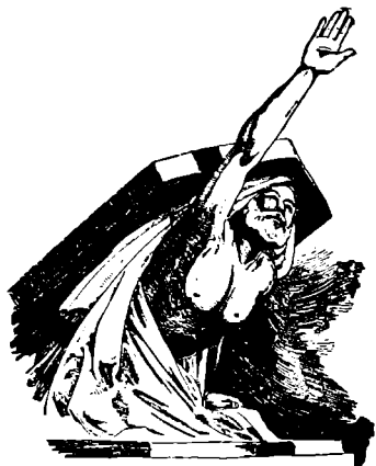
JULES VERNE'S TOMBSTONE AT AMIENS PORTRAYING HIS IMMORTALITY