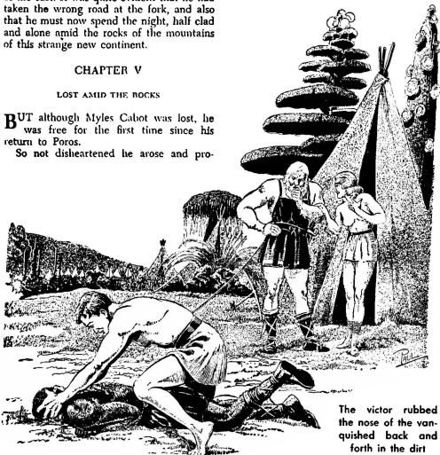
The victor rubbed the nose of the vanquished back and forth in the dirt

The bush, which furnished the leaf to fashion the cup, closely resembled the tartan bushes of Cupia, whose heart-shaped leaves are put to so many uses in that country. Myles Cabot accordingly stripped off a