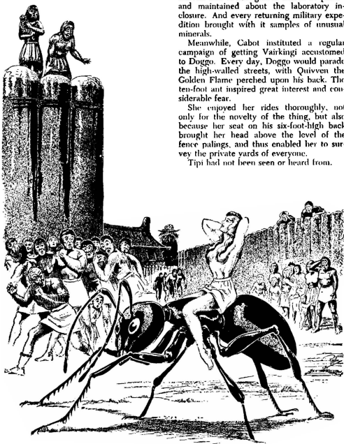
Every day Doggo would parade the high-walled streets with Quivven the Golden Flame perched on his back