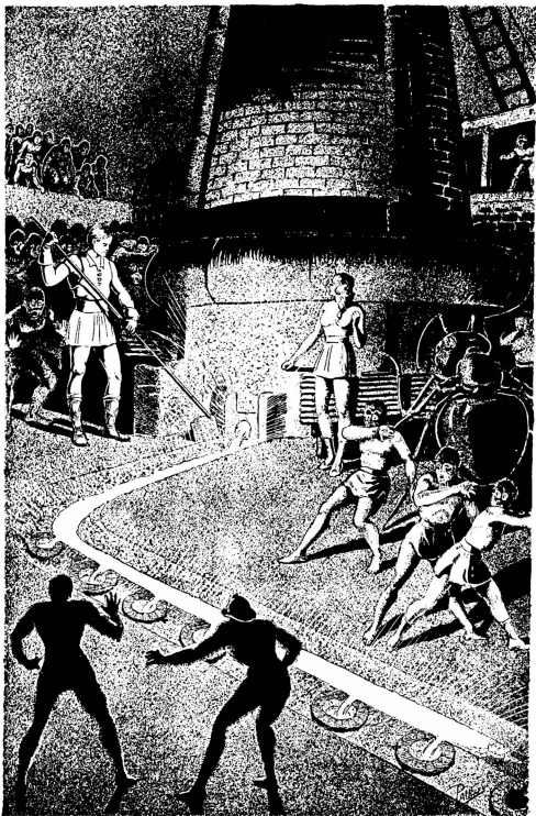
The devil-furnace of the great magician was now in full blast