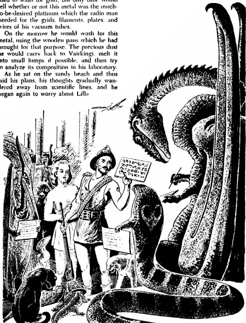
He boldly confronted the winged king

It was many days since she had sent the S O S which had recalled him from earth to Poros. Whatever she had feared must have happened by now. It was possible that he would never be able to effect a return to Cupia. Why not then accept the inevitable, settle down permanently among the Vair-