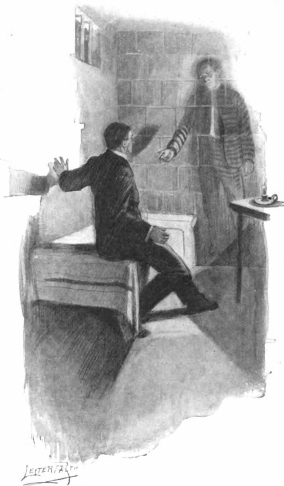
"I WALKED THROUGH THE WALL BEFORE HIS AMAZED EYES, AND WALKED BACK AGAIN."

took a couple of small smooth pebbles, previously prepared, from the chamois bag into which I had put them with some others and an aluminum wafer treated for the larger displacement, and slipped one securely