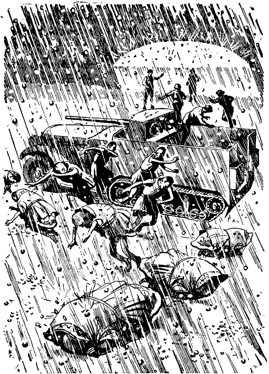
The Teranu hurled themselves to the ground, and drew their heads into their shells, while the Earthmen dashed for the protection of the shield.