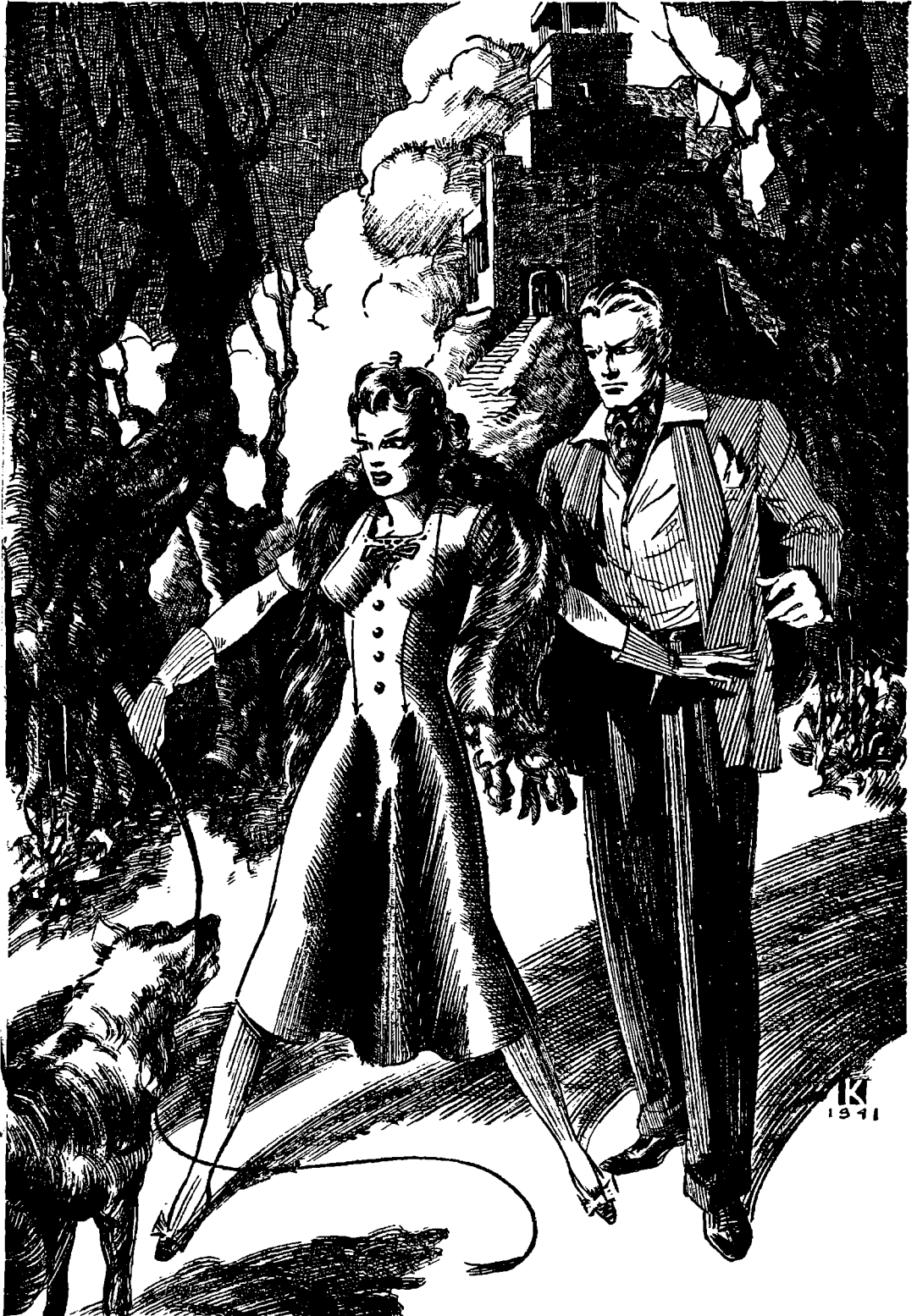
Incredibly the slim whip held the maddened dogs at bay