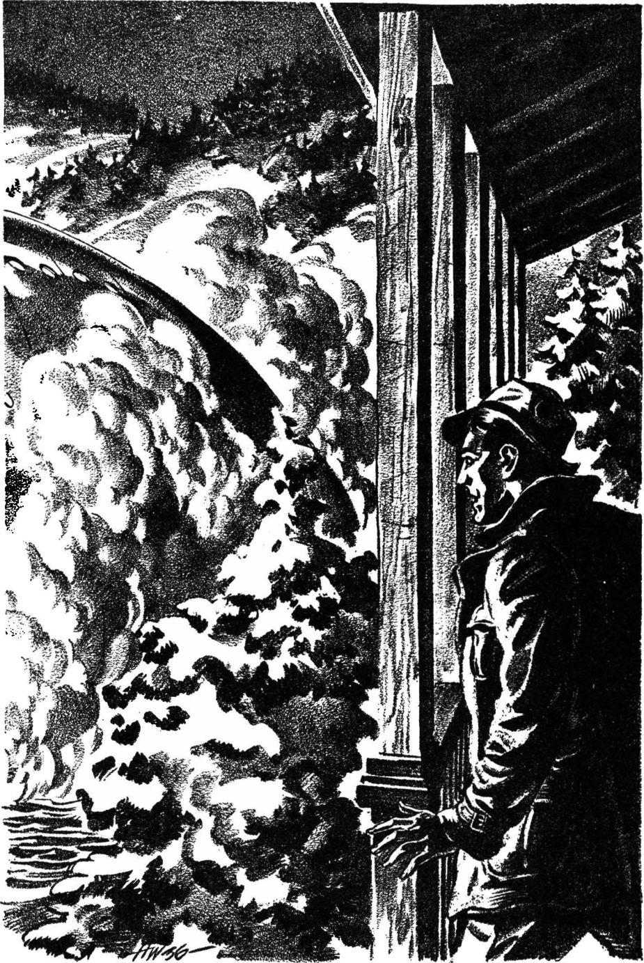
Out in front there had been a lake— It no longer existed!