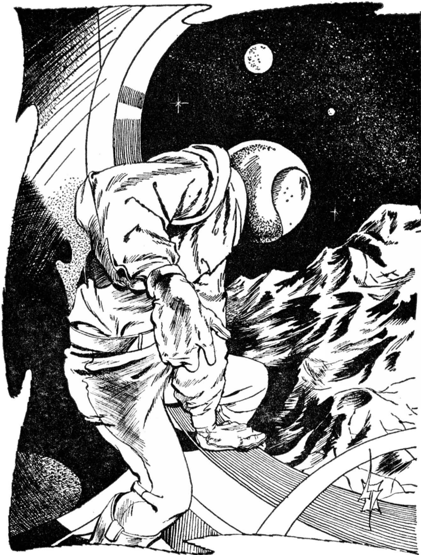
Illustrated by IVIE