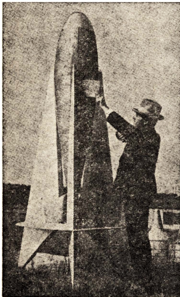
Johannes Winkler examines his second rocket, which he was not allowed to test