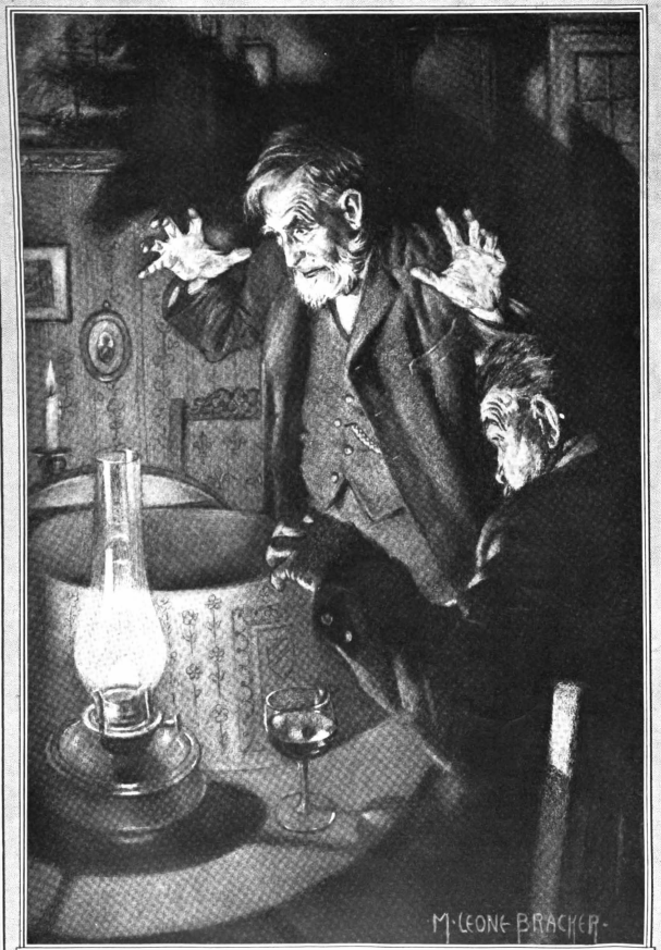
"What? . . . It's gone, man, the skull is gone!"

NO, THERE'S nothing the matter with me. I'm only trying to collect my thoughts. It's so strange, I'm positively certain that it was inside when I put on the seal last spring. I can't have imagined that: it's utterly impossible. If I ever took a stiff glass with a friend now and then, I would admit that I might have made some idiotic mistake when I had taken too much. But I don't, and I never did. A pint of ale at supper and half a gin and rum at bedtime was the most I ever took in my good days. I believe it's always the sober fellows who get rheumatism and gout! Yet there was my seal, and there is the empty hand-box. That's plain enough. I say, I don't half like this. It's not right. There's