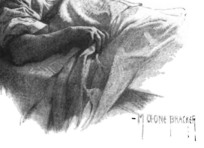
"By the hands or teeth of some person unknown"

The knocking is over—the wind that blows it across the floor, that's all—there's had a hurricane in the night. I'll have you up there! I have got got it! The band-box is on the table. One minute, and I'll have the bar up there! There!