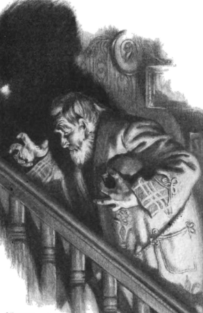
"Then I took it and carried it up"

I did not sleep much more that night. It was not more