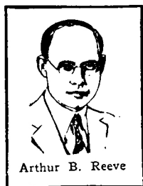
Arthur B. Reeve

● C AN ghosts walk? And if they do, can their ● ● footsteps be recorded on a machine? And ● ● are the spirits of the phantom world subject to ● ● the same physical phenomena as our human ● ● bodies? These are tantalizing questions which ● ● arise during the thrilling and complex mystery ● ● into which Craig Kennedy and Jameson are ● ● plunged without warning. ● ● As usual, Craig foresees potentialities and pos- ● ● sibilities unrecognized by ordinary minds, and ● ● with his profound knowledge of applied sci- ● ● ences, is able to approach the enormous tasks ● ● confronting him from a new and scientific an- ● ● gle. This is one of the finest, as well as scientific, ● ● of Arthur B. Reeve's stories. ●