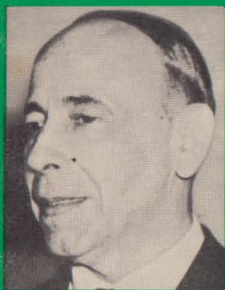
Gen. Humberto Delgado: he called it "lawful revolt"