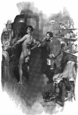
"I covered his right leg, and he was as a one-legged man defying all laws of gravitation."

But, passing along a narrow path through a clump of cottonwoods, some object brushed