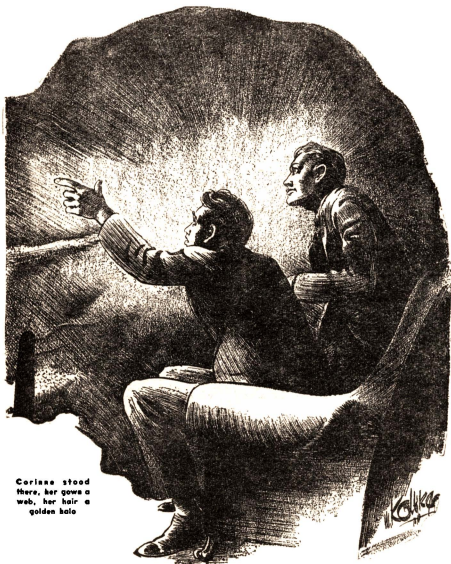
Corinne stood there, her gown a web, her hair a golden halo

her honeymoon. But his provincial medicine was wrong. Within twenty minutes Corinne was dead.