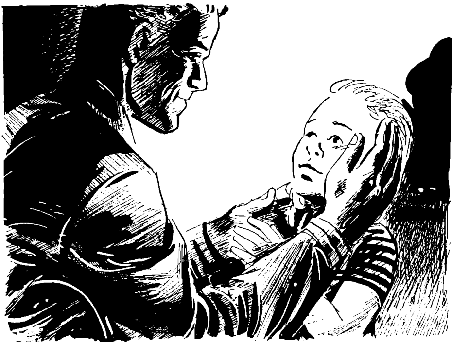
After Libby left, Bahr fondled the child.

did they dump out of their jobs during the last Condition B? Not a damned one. And they're not going to pull me out now. If they were going to do it, Adams would already have put it through after the conference yesterday."