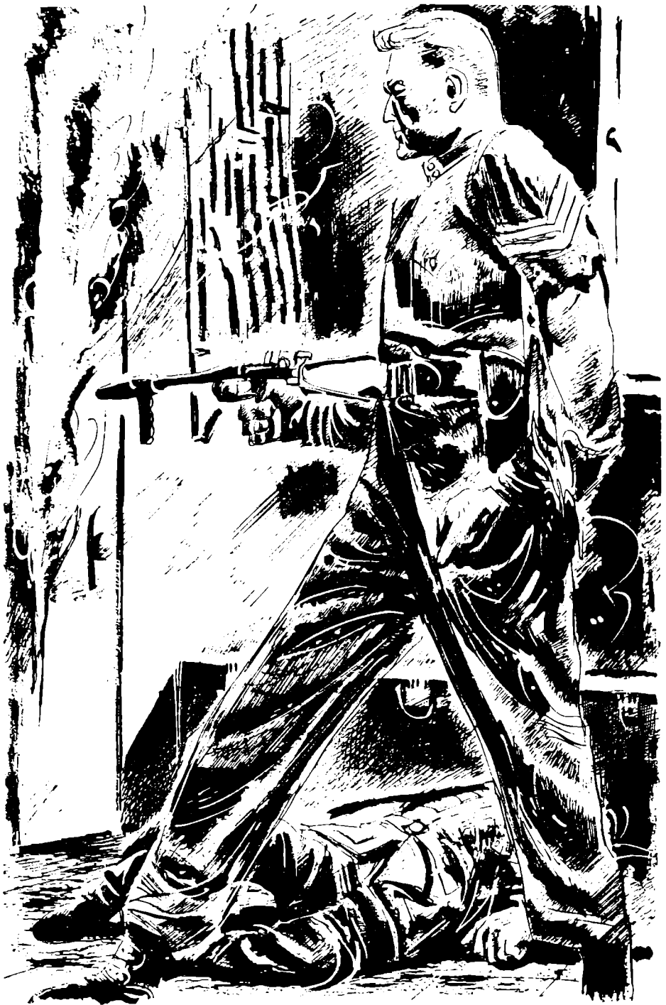
Contemtuos of the odds against him, Bahr faced destruction.