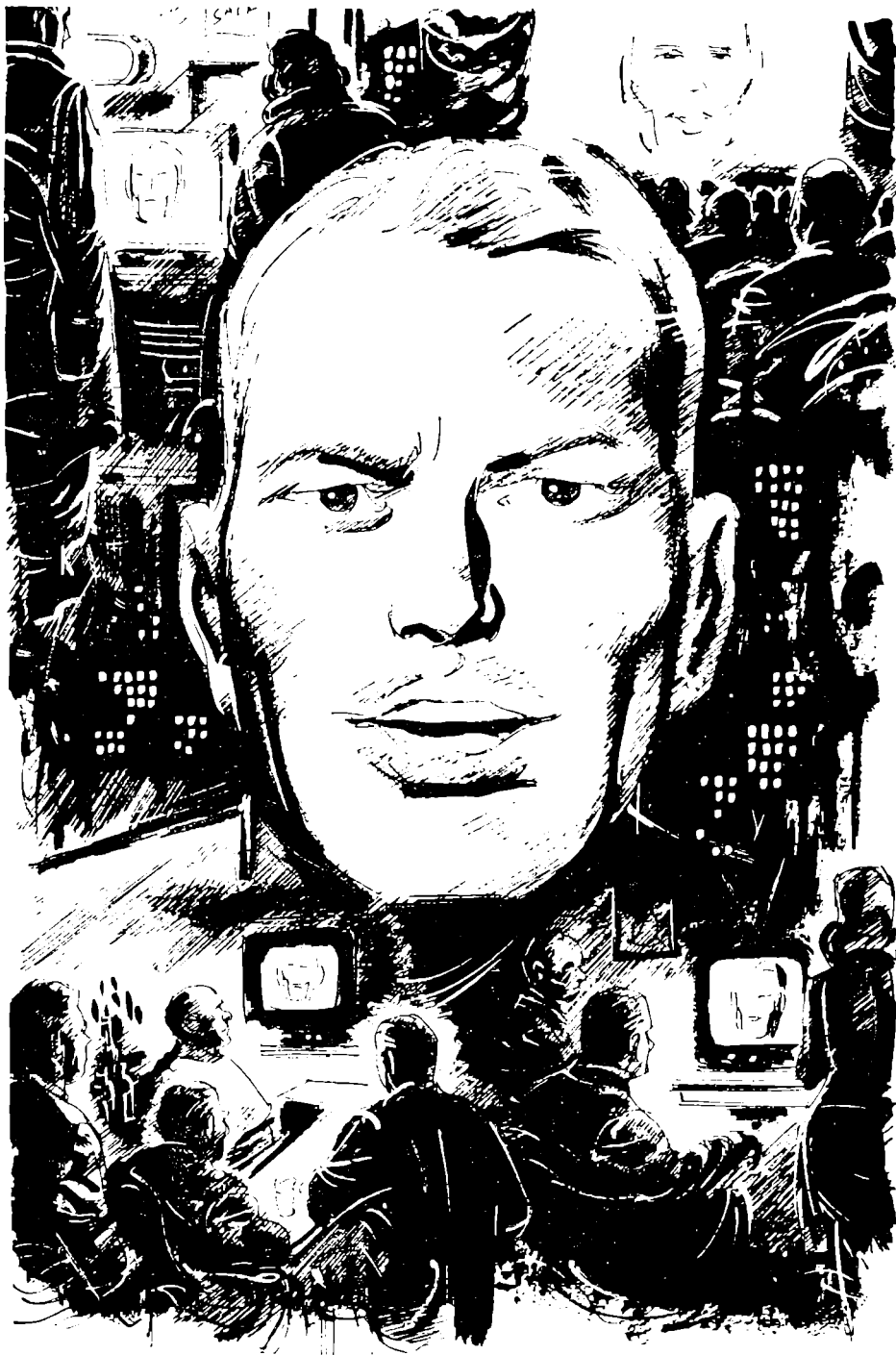
Bahr's voice went around the world, changing him from a man to a symbol.