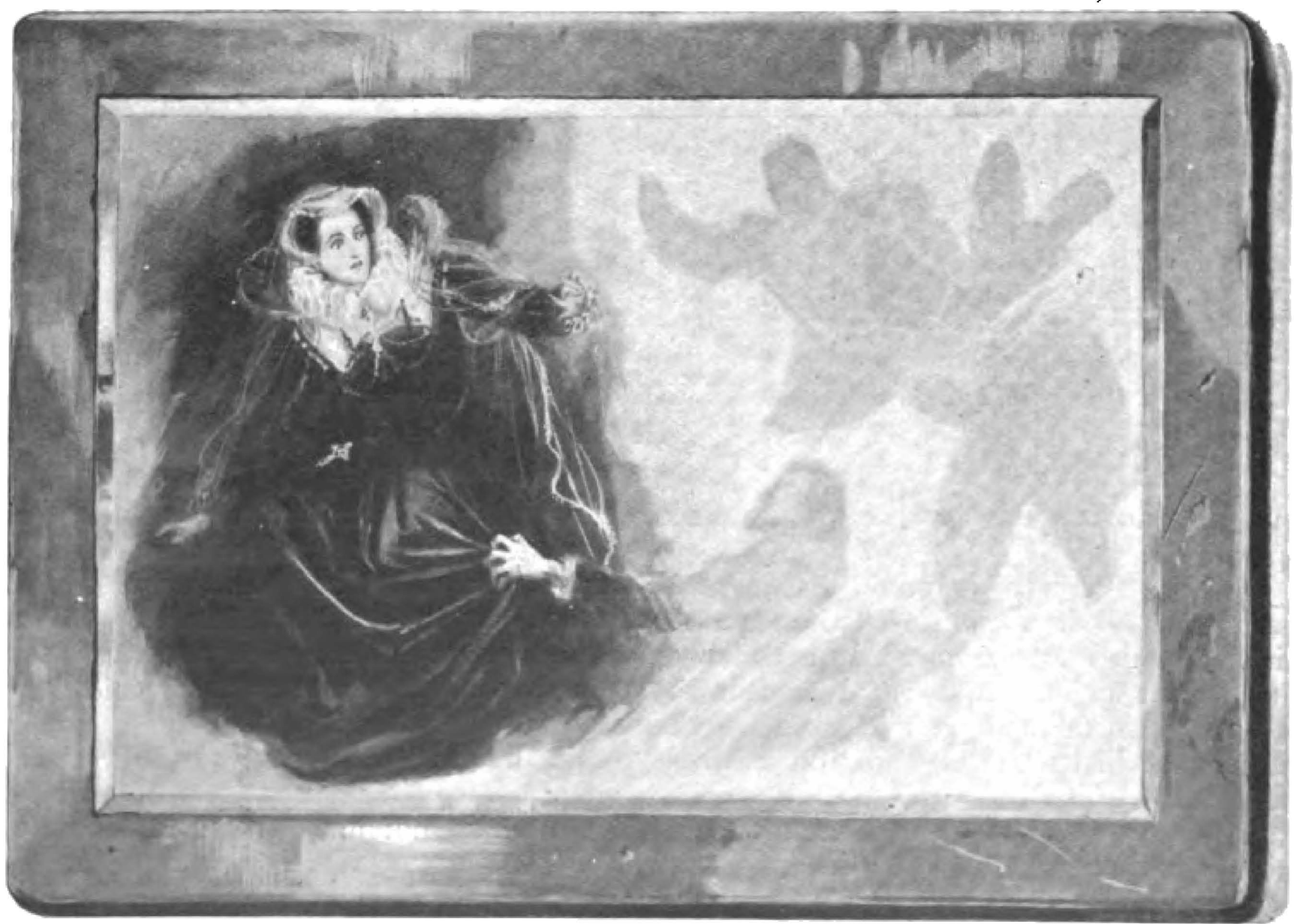
"IT WAS THE HAND OF A MAN CLENCHED AND KNOTTED IN AGONY."

The doctor says I must drop work for a day, and I can afford to do so, for I have made good progress lately. It is quite evident that the visions depend entirely upon my own nervous state, for I sat in front of the mirror for an hour to-night, with no result whatever. My soothing day has chased them away. I wonder whether I shall ever penetrate what they all mean? I examined the mirror this evening under a