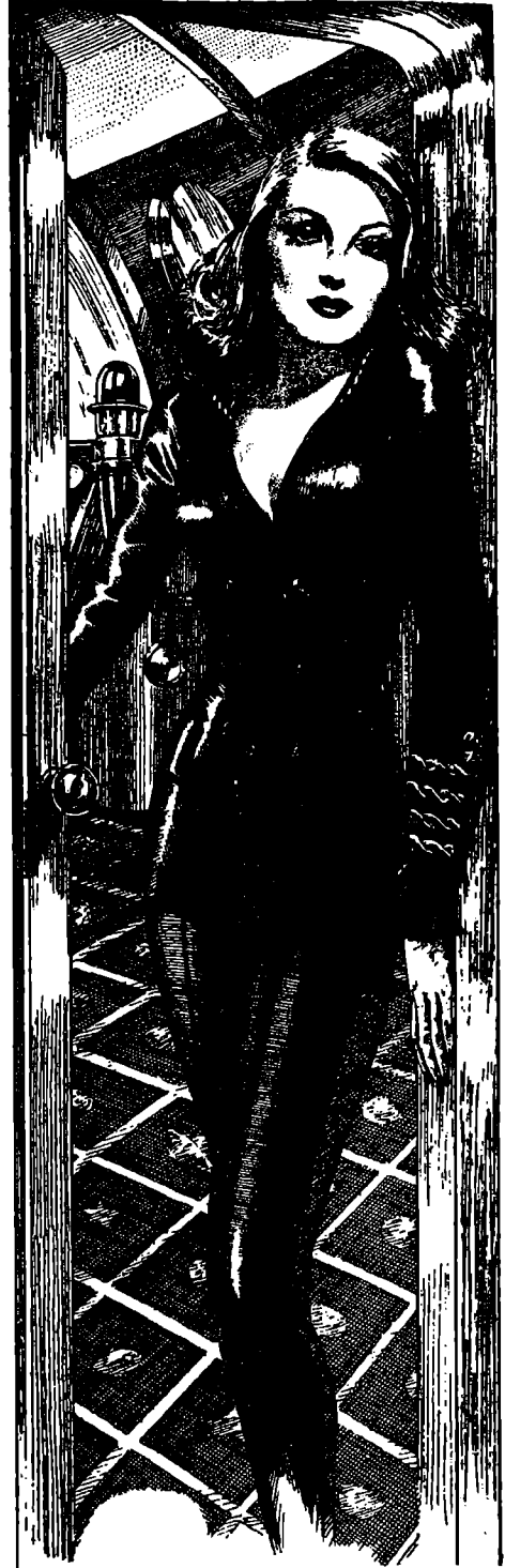
Everything about her except the glossy, shining uniform was —Peri

To Deker's right, three bent peeled poles leaned together, supporting the huge gong. Two ragged figures stood beside it with clubs in their hands. It was difficult to make out details characterizing the horde groveling on the slope that stretched from the vault into a dark valley of warped metal and