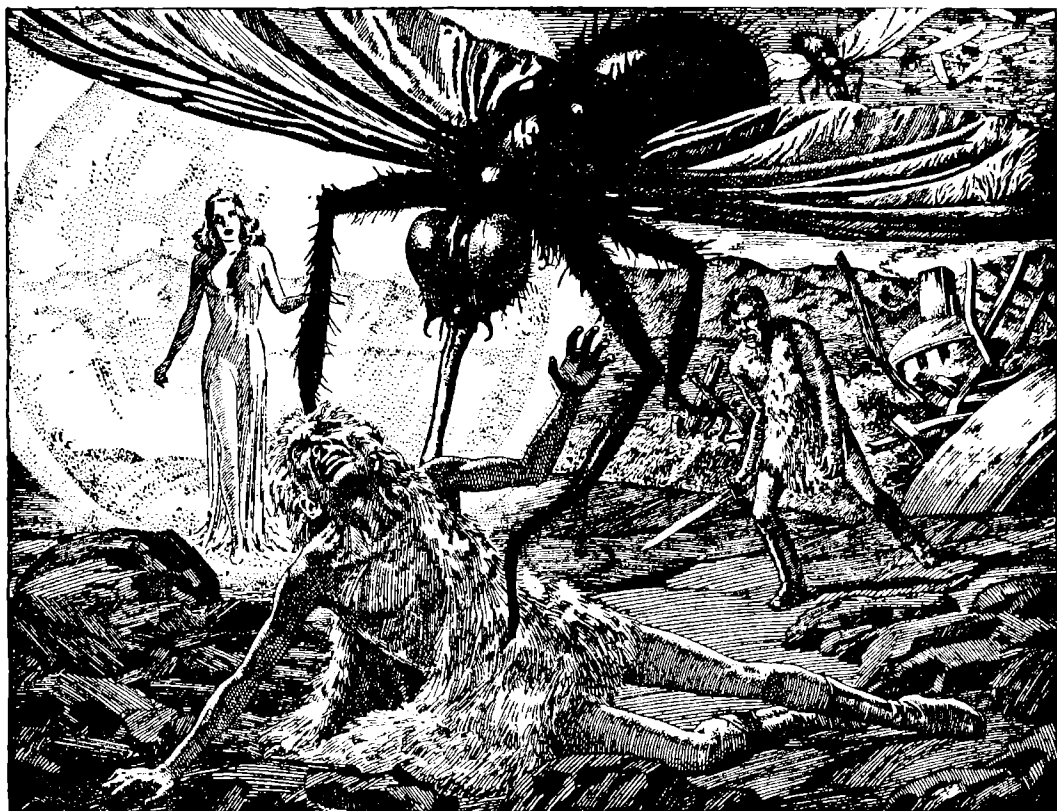
As Deker retrieved his sword, the long lance smacked, stuck into the albino's twitching back