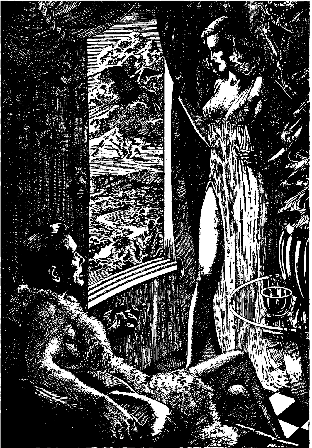
The girl stood looking out of the window of her sanctum