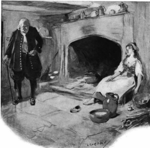
"There sat Christina, asleep before the burnt-out grate."

thrown straight at the wicked mouth, should silence it, and by chance his hand lighted on the pedlar's silver flask. In the same instant Nicholas Snyders' hand had closed upon it also. The grin had died away.