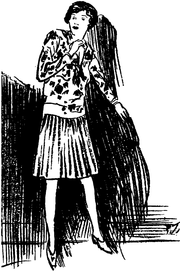
I stuck there, hesitating, shaking—

find myself in an empty house with a stranger. Something of my confidence left me. Confidence with women, you know, is all humbug after a certain point. Or perhaps you don't know, for most of you are men. But anyhow my pluck ebbed in a quick rush, and I felt afraid.