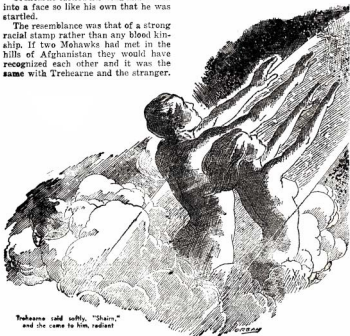
Trehearne said softly, "Shairn," and she came to him, radiant

"Since yesterday," answered Trehearne and knew as he formed the words that they were not the ones expected of him. A wild throb of excite-