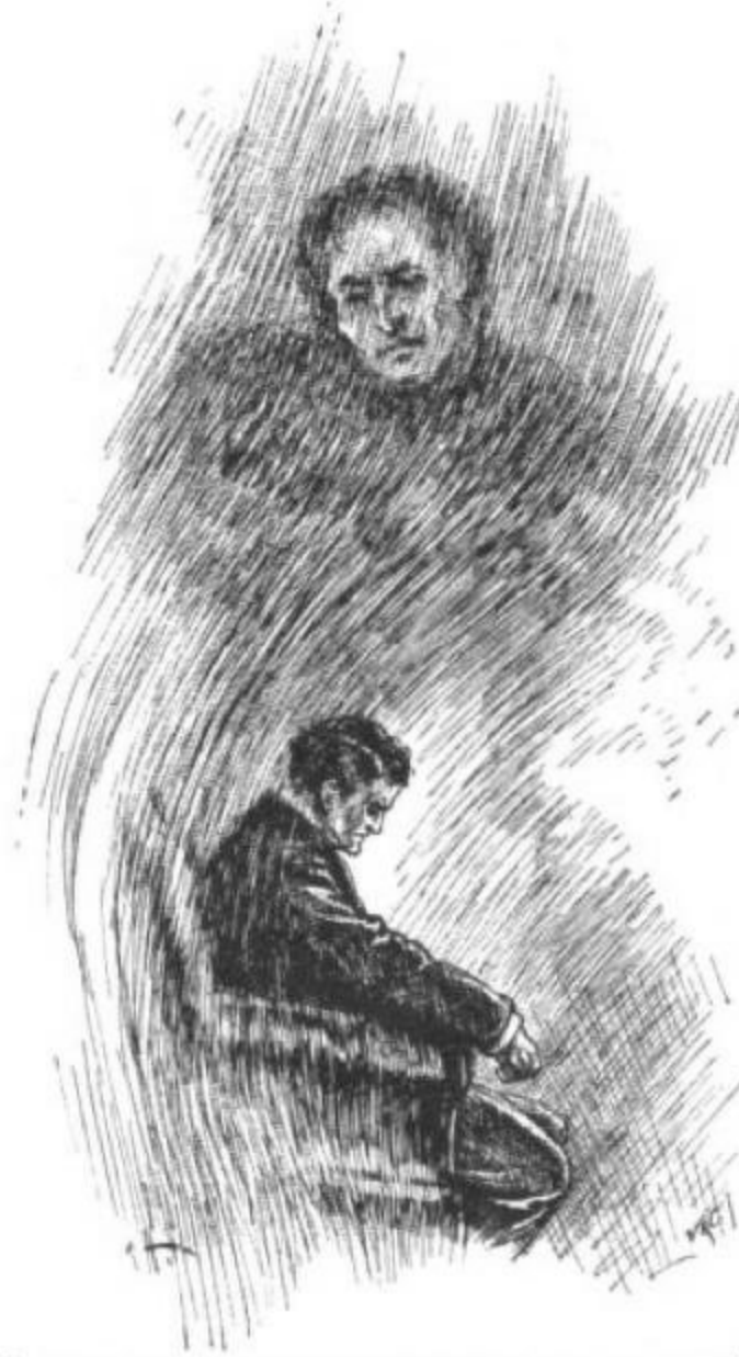
"I WAS A GREAT CLOUD ANCHORED TO MY BODY."

"I felt as a kitten may feel," he said, "when it goes for the first time to pat its reflection in a mirror." Again and again, on the occasion when I heard him tell this story, Mr. Bessel returned to that comparison of