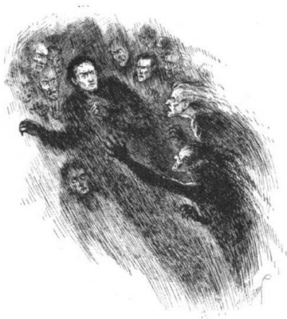
"NEVER A SOUND FROM THE MOUTHS THAT SEEMED TO GIBBER."

ing cloud-stuff was a face. And such faces! Faces of thin shadow, faces of gaseous tenuity. Faces like those faces that glare with intolerable strangeness upon the sleeper in the evil hours of his dreams. Evil, greedy eyes that were full of a covetous curiosity, faces with knit brows and snarling, smiling lips: their vague hands clutched at Mr. Bessel as he passed, and the rest of their bodies was but an elusive streak of trailing darkness. Never a word they said, never a sound from the mouths that seemed to