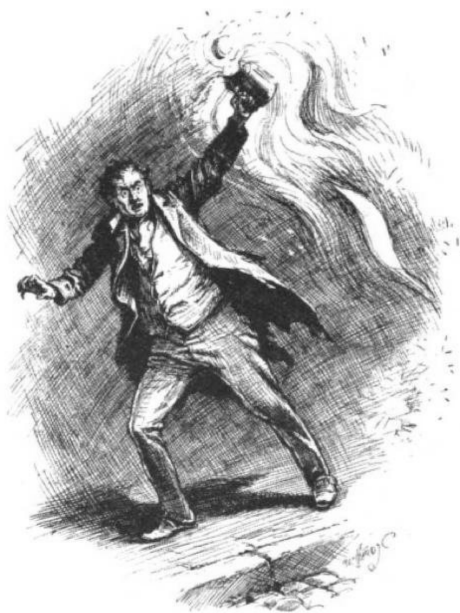
"FLOURISHING A CAN OF BURNING COLZA OIL."

Here was a fresh astonishment for Mr. Vincent. He had found considerable comfort in Mr. Hart's conviction: "He is bound to be laid by the heels before long," and in that assurance he had been able to suspend his mental perplexities. But any fresh development seemed destined to add new impossibilities to a pile already heaped beyond the powers of his acceptance. He found himself doubting whether his memory might not have played him some grotesque trick, debating