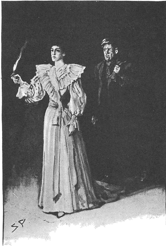
"NOW COME WITH ME."

county. But what does he care for that? He only cares for one thing in the whole world, and that you can take from him this night. Have you a bag?"