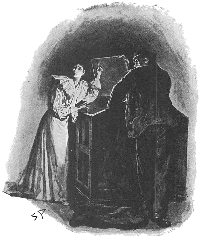
"HIST!", SHE WHISPERED."

She worked upon me so, partly with her scorn and partly with this money which she held before my eyes, that I believe I should have yielded and taken my chances upstairs, had it not been that I saw her eyes following the struggle within me in such a crafty, malignant fashion, that it was evident she was bent upon making me the tool of her revenge, and that she would leave me no choice but to do the old man an injury