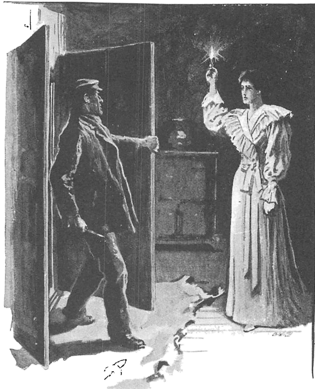
"DON'T BE FRIGHTENED!" SAID SHE."

with which I had opened the shutter. I was unshaven and grimed from a week on the roads. Altogether, there are few people who would have cared to face me alone at one in the morning; but this woman, if I had been her lover meeting her by appointment, could not have looked upon me with a more wel-