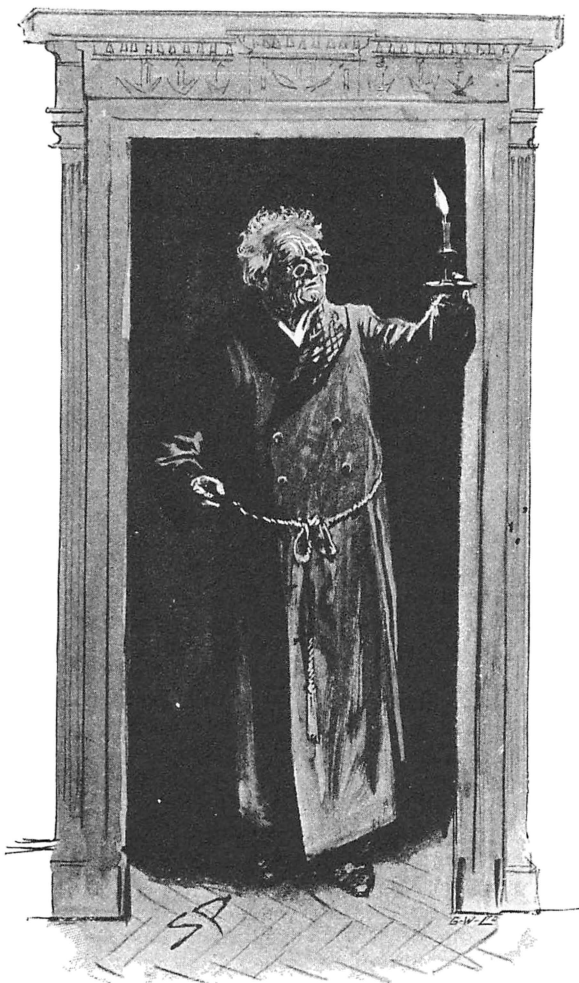
"HE STOOD THERE HOLDING THE CANDLE.

The light of a candle shone through the door of the museum, and the shuffling steps came nearer and nearer. Then I saw a face in the doorway, a great, heavy face, all lines and creases, with a huge curving nose and a pair of gold glasses fixed across it. He had to throw his head back to see through the glasses, and that great nose thrust out in front of him like the beak of some sort of fowl. He was a big man, very tall and burly, so that in his loose dressing-gown his figure seemed to fill up the whole doorway. He had a pile of grey, curling hair all round his head, but his face was clean-shaven. His mouth was thin and small and