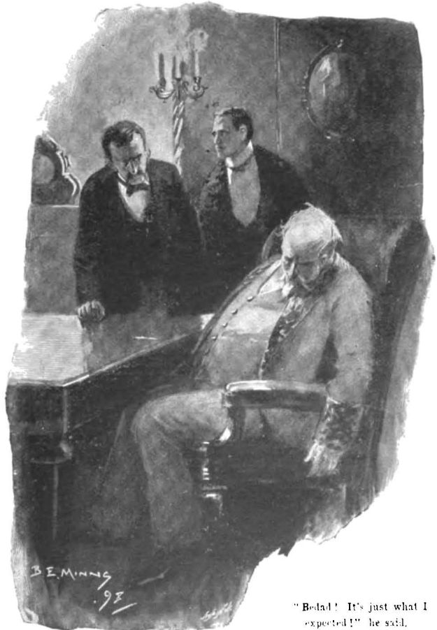
"Bedad! It's just what I expected!" he said.

"We have just come from America, and I can recall something of what you mention, but I did not connect them with this house. As you have attended