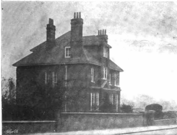
No. 1, Karma Crescent. From a Photograph.

Karma Crescent is one of several similar terraces planned and partially built upon a newly-opened estate in an outlying suburb of London. The locality is good, though not fashionable, hence the houses,