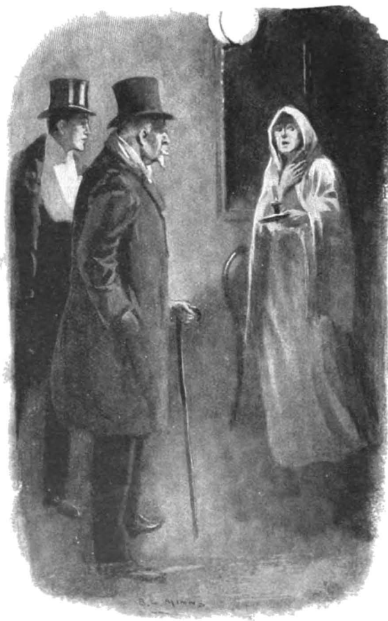
They found their housekeeper scared and shaking.

sound, and it has been definitely decided that the English law can take no account of ghosts, the Hendriks were obliged to stick to their bargain. Finally, the Colonel, who was a widower, secured the services of a gaunt Scotch housekeeper, professing herself well acquainted with the habits of ghosts, and took up his residence with his son at No. 1, being fully persuaded that a free use of shooting-irons was likely to prove as good a preventive against hauntings as against any other form of annoyance.