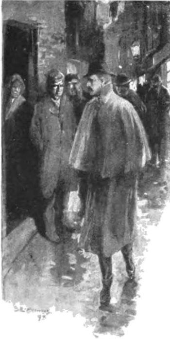
He visited the unpleasant colony of houses by the river.

"No; my father thought that, under the circumstances, it had better be secured. It was never used. And, as there is no