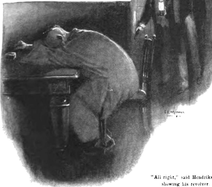
"All right," said Hendriks, showing his revolver.

"I calculated," began Low, when this outburst was over, "I calculated that as the murderer had not yet accomplished his purpose of driving us out of the house, he would return to his diabolical work sooner or later.