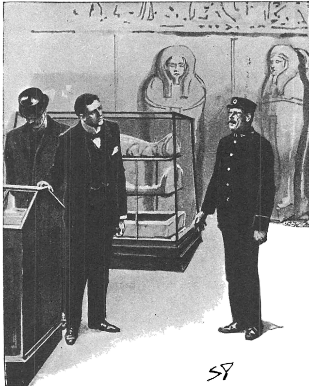
"I NEVER SAW A SOUL, OR HEARD A SOUND,"