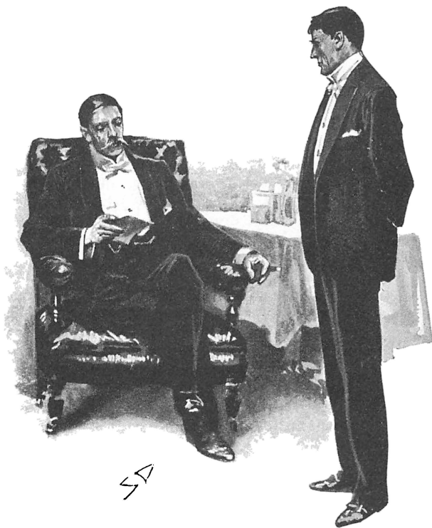
"THIS WARNING IS MEANT IN A FRIENDLY SPIRIT."

put up the great iron shutters, which are absolutely burglar-proof. The watchman is a capable fellow. He sits in the lodge, but he walks round every three hours. We keep one electric light burning in each room all night."