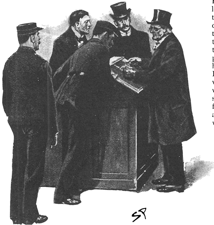
"I WILL SWEAR THAT THOSE STONES ARE GENUINE."

"You look a little tired yourself, Miss Andreas," said my friend,