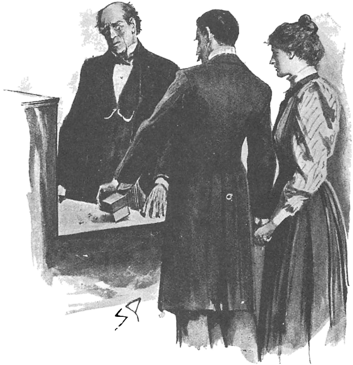
"HE TILTED OUT THE CONTENTS."

"That I got them. They are in this box.'