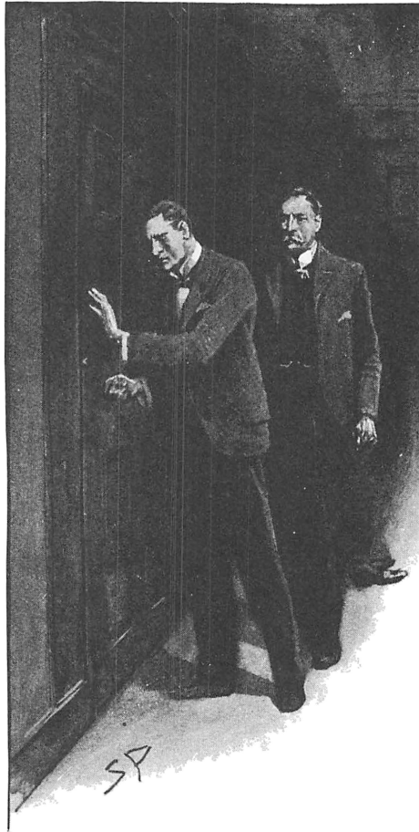
"THIS HE OPENED SOFTLY WITH HIS KEY."