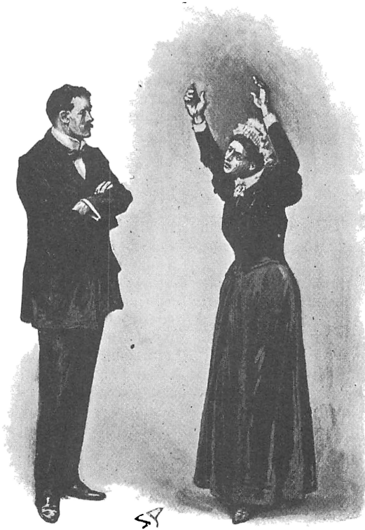
"THREE BITTER YEARS THEY HAVE BEEN TO ME."

playing-field within the college grounds, and that was his furthest point. If the boys went out, it was I or Dr. McCarthy who accompanied them. St. James gave as a reason for this that he had injured his knee some years before, and that walking was painful to him. For my own part I put it down to pure laziness upon his part, for he was of an obese, heavy temperament. Twice however I saw him from my window stealing out of the grounds late at night, and the second time I watched him return in the grey of the morning and slink in