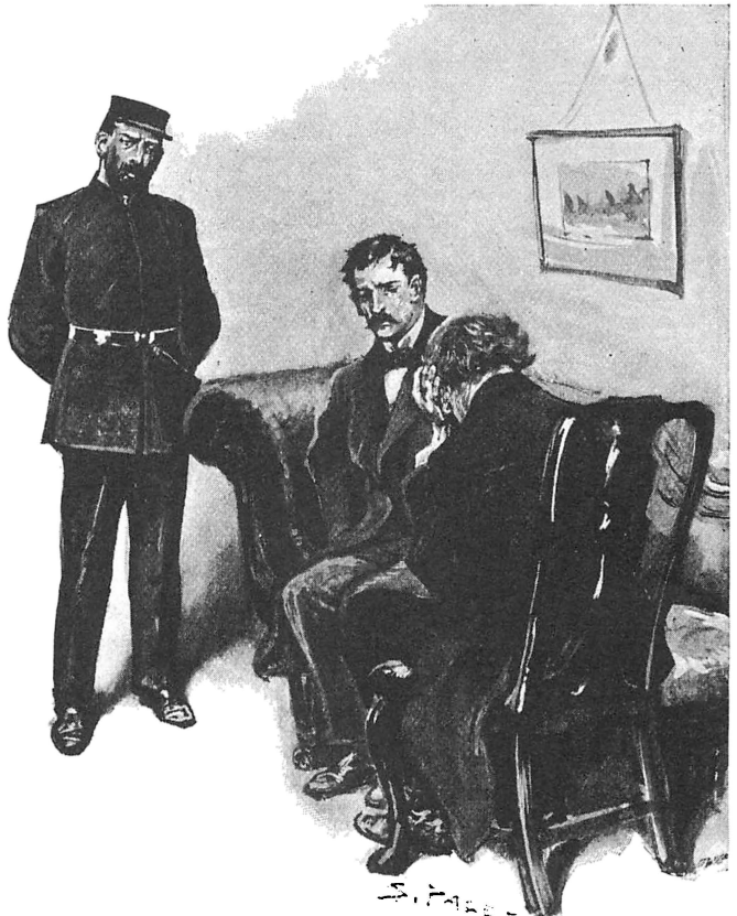
"DR. MCCARTHY SANK HIS HAGGARD FACE UPON HIS HANDS."

"God knows I have!" cried Dr. McCarthy, and sank his haggard face upon his hands.