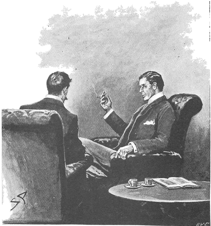
"MY DEAR CHAP, IT'S NO USE."

courtly, inoffensive fellow. I never met a man with more gentle manners."