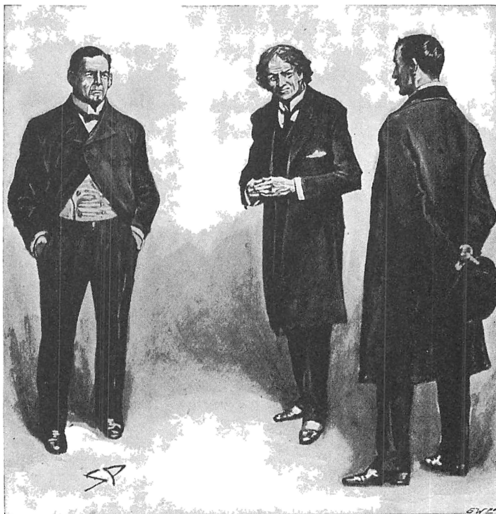
"‘I HEAR YOU’VE NEVER BEEN OUT BEFORE,’ SAID HE.”

the principal. "Surely you will allow that, Mr. St. James?"