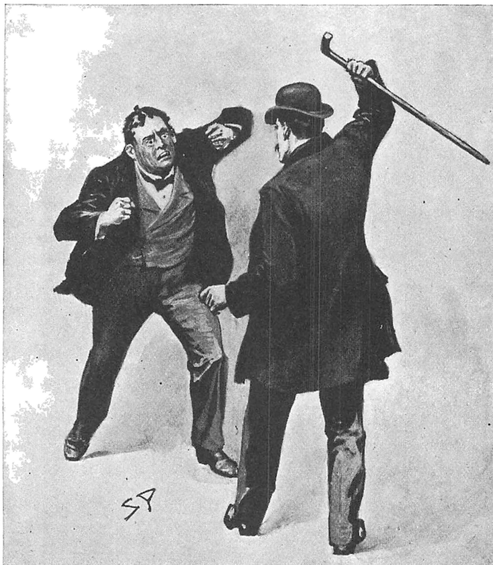
"I CUT AT HIM WITH MY STICK."

"Alas, yes. What sin have I ever committed that I should have such a punishment? He has made my whole life a misery from the first years of his boyhood. Violent, headstrong, selfish, unprincipled, he has always been the same. At eighteen he was a criminal. At twenty, in a paroxysm of passion, he took the life of a boon com-