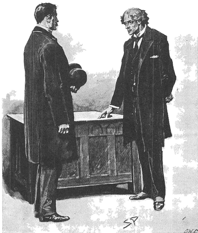
"THE PRINCIPAL OF THE ACADEMY."

The warnings and insinuations of the agent had prepared me to meet a choleric and over-bearing person—one whose manner was