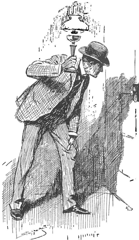
"THE DOOR HAD A SEAL OF RED WAX OVER THE KEYHOLE."

"I think, after your kind attention to me. I cannot do less than relieve any curiosity