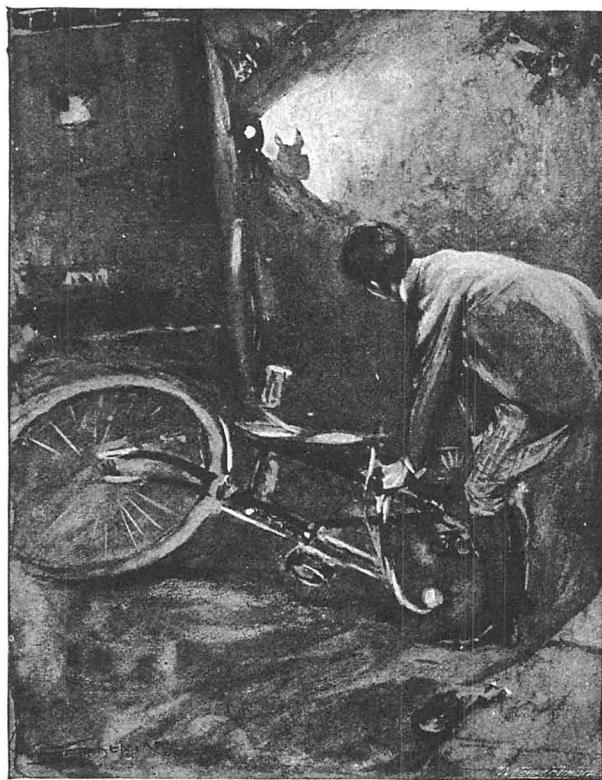
"HE ROSE, SNARLING."

black and silent as if no one had ever lived in it.