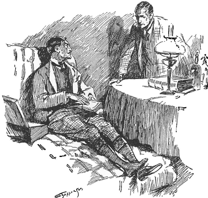
"HERE I HAVE MY FATHER'S LETTERS."

"Oh, yes, we had heard before, and that's where our mystery of the sealed door, upon which you stumbled to-night, has its origin. Pass me that desk, if you please. Here I have my father's letters, and you are the first man except Mr. Perceval who has seen them."