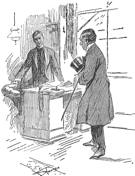
"I BELIEVE, SIR," SAID HE, "THAT MY NAME HAS BEEN MENTIONED TO YOU?"

young acquaintance were waiting for me in the little room. I was not surprised to see the young man looking pale and nervous, but I was rather astonished to find the dry little City man in a state of intense, though partially suppressed, excitement. His cheeks were flushed, his hands