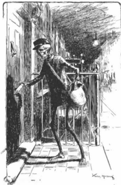
"There was only one"

"And half-a-dozen times, at least, every year," said I, "we must have walked home