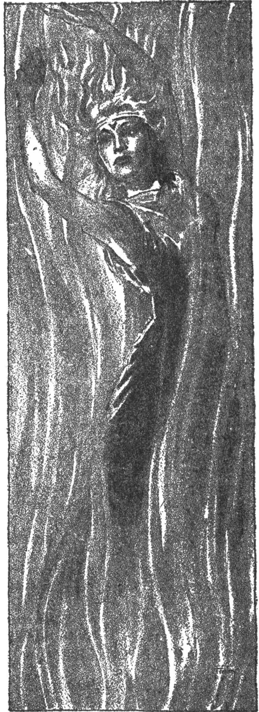
Circe, the enchantress.

one in my central courtyard," she replied. "It is quite a way back. The