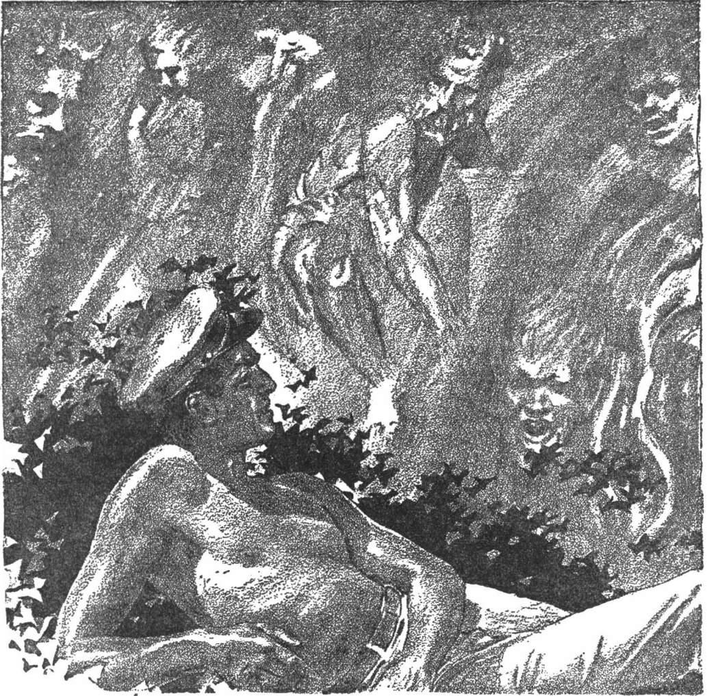
"The worn images were laughing and gesticulating with queer movements."

serves curious resemblances to certain characteristics of man in even the lowest shapes of life. Would you happen to know, Madam, if one of your island pets—limps?"