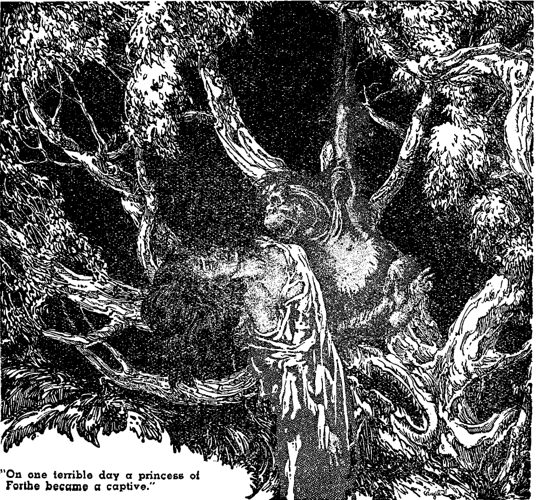
"On one terrible day a princess of Forthe became a captive."

He extended his left hand with outspread fingers pointing at the blackness of the damp walls. A second, two sec-