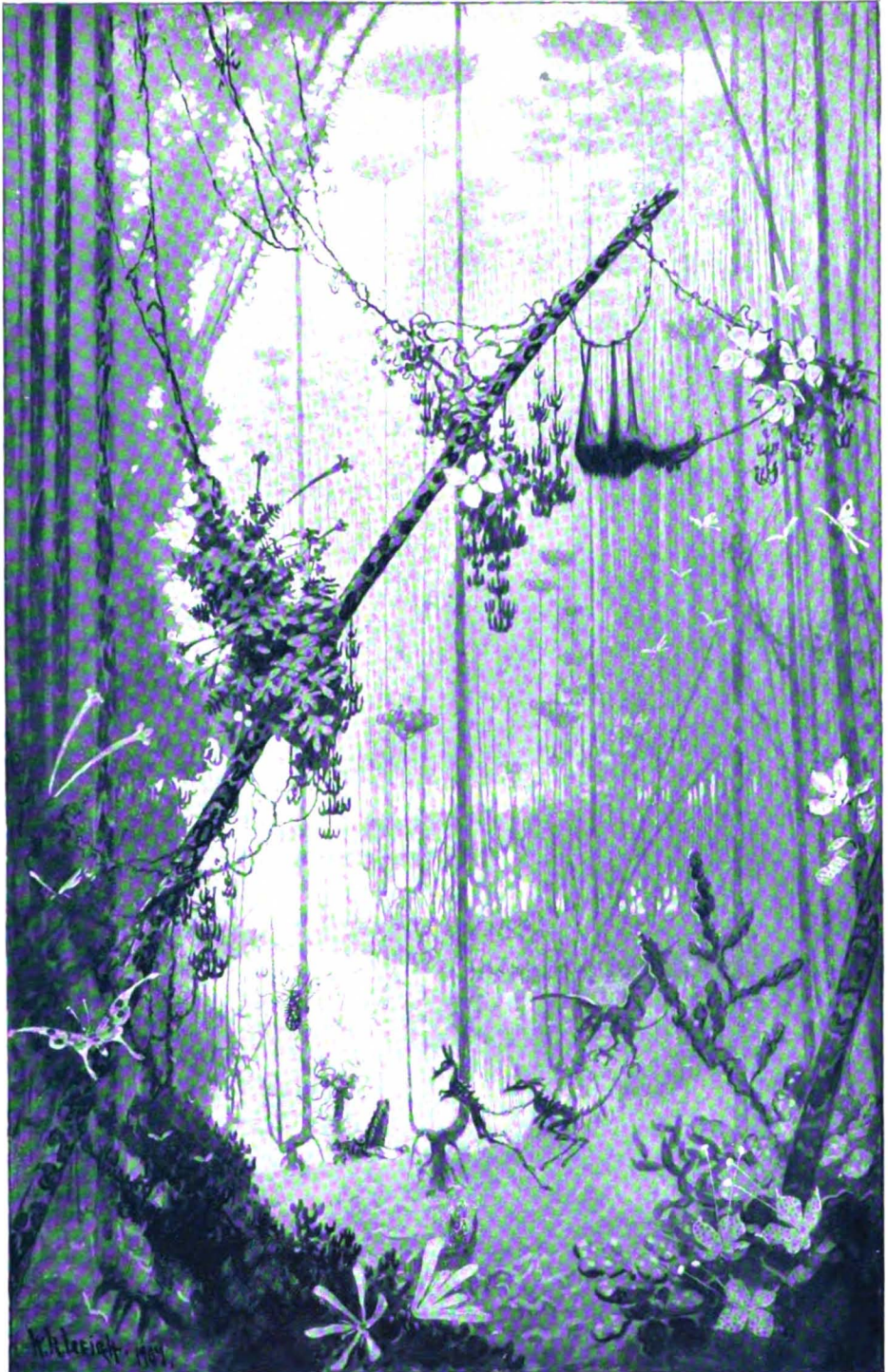
A JUNGLE OF BIG, SLENDER, STALKY, LAX-TEXTURED, FLOOD-FED PLANTS WITH A SORT OF INSECT LIFE FLUTTERING AMIDST THE VEGETATION