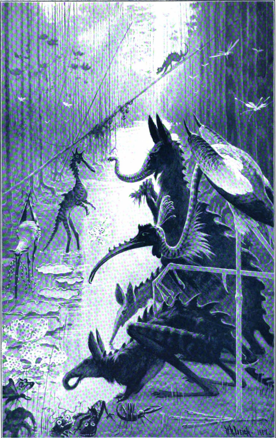
THE SAME REASON THAT WILL MAKE THE VEGETATION LAXER AND FLIMSIER WILL MAKE THE FORMS OF THE MARTIAN ANIMAL KINGDOM LAXER AND FLIMSIER AND EITHER LARGER OR ELSE SLENDERER THAN EARTHLY TYPES