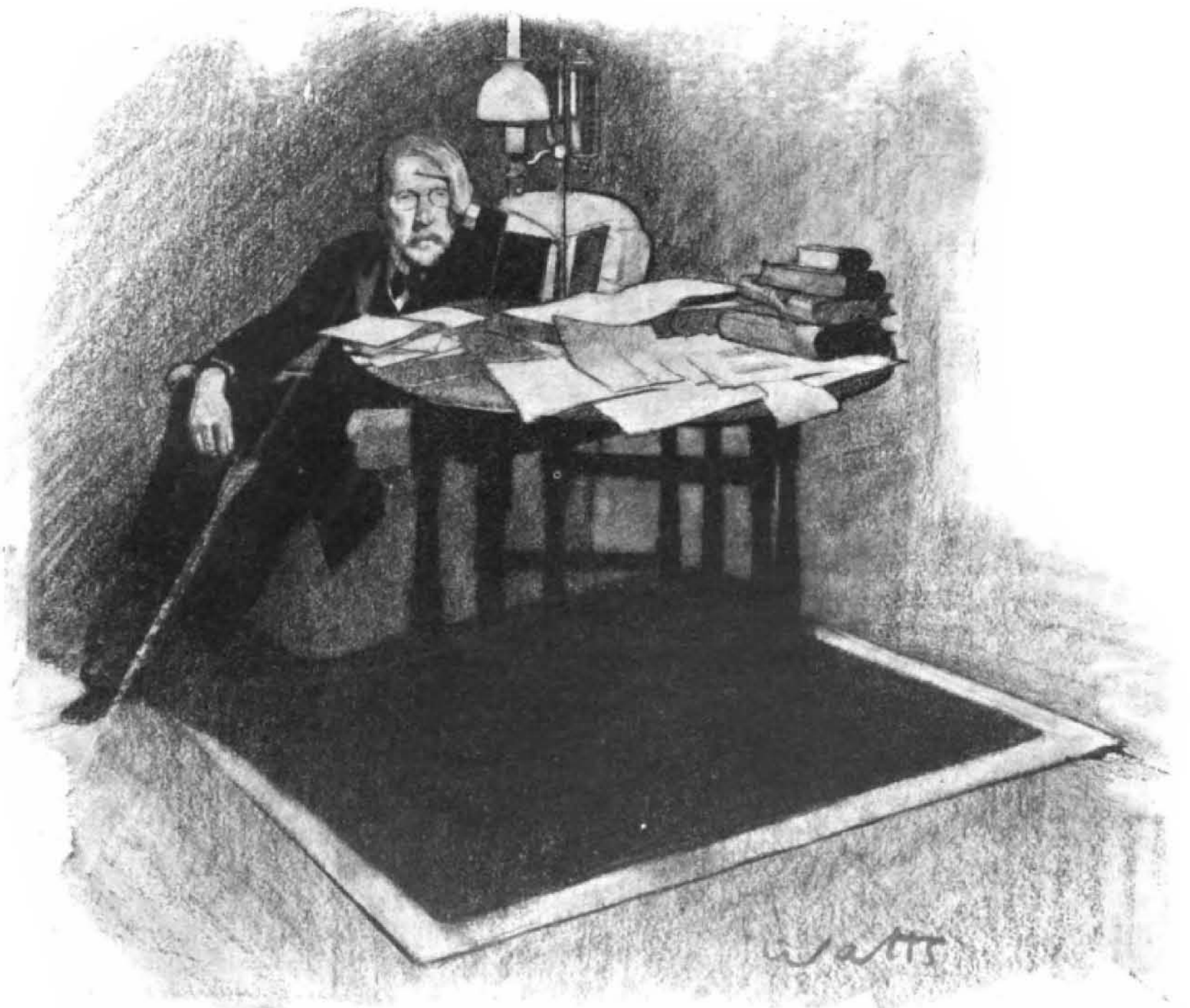
"THE DOCTOR WAS SITTING IN AN ARM-CHAIR NEAR A TABLE."

"In a big house like this," said the doctor,