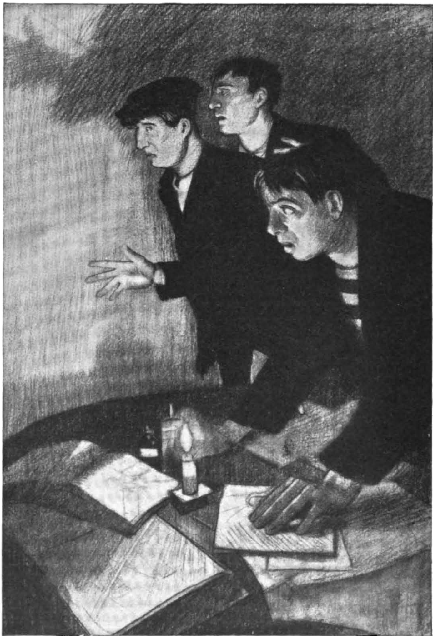
"THEY WERE THE APACHES WHO HAD SET ON HIM IN THE STREET."

Against that gate-post the police came upon him. They took him to the address they found on him. When they came to question