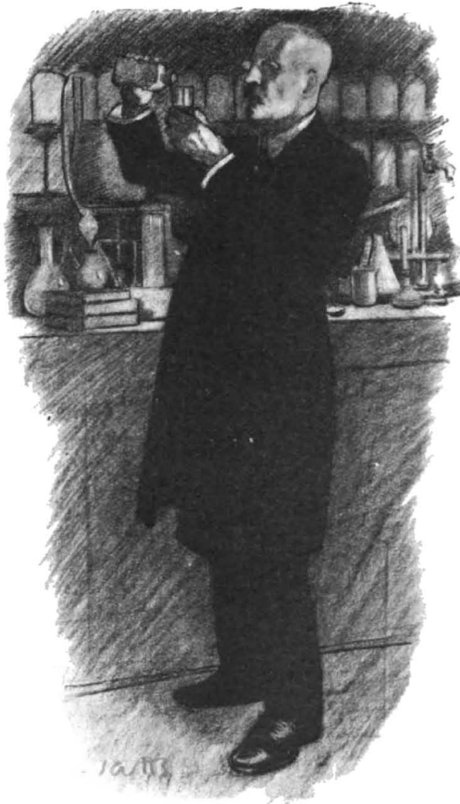
"HE MEASURED OUT CERTAIN DROPS INTO A GRADUATED GLASS"

"The others," said the doctor, frowning, "were unsound. Decadent students, degenerate Apaches. You are highly trained—in fine physical condition. And your brain!