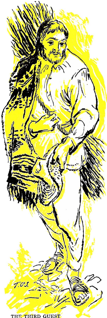
THE THIRD GUEST

By now he had become really old and felt that he had a right to spend the last few years of his life in peace.