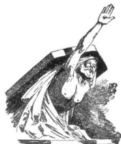
JULES VERNE'S TOMSTONE AT AMIENS PORTENDING HIS IMMORTALITY