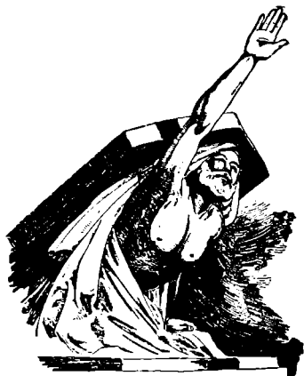
JULES VERNE'S TOMBSTONE AT AMIENS PORTRAYING HIS IMMORTALITY